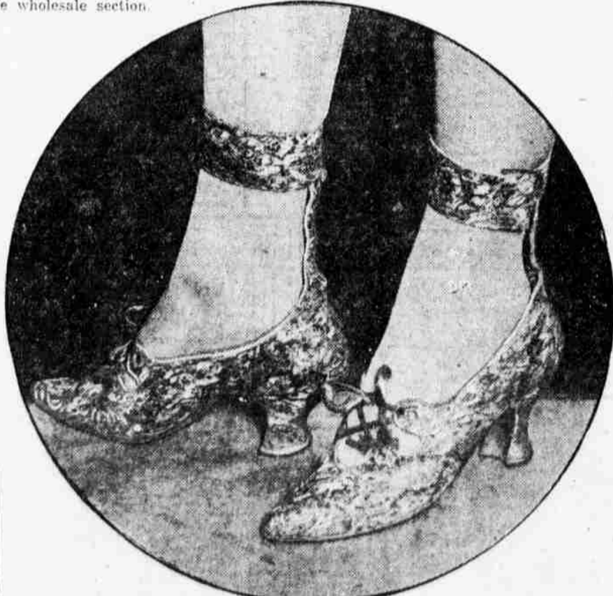
SHORTAGE and high cost of leather in France have resulted in the adoption of cloth-top shoes.