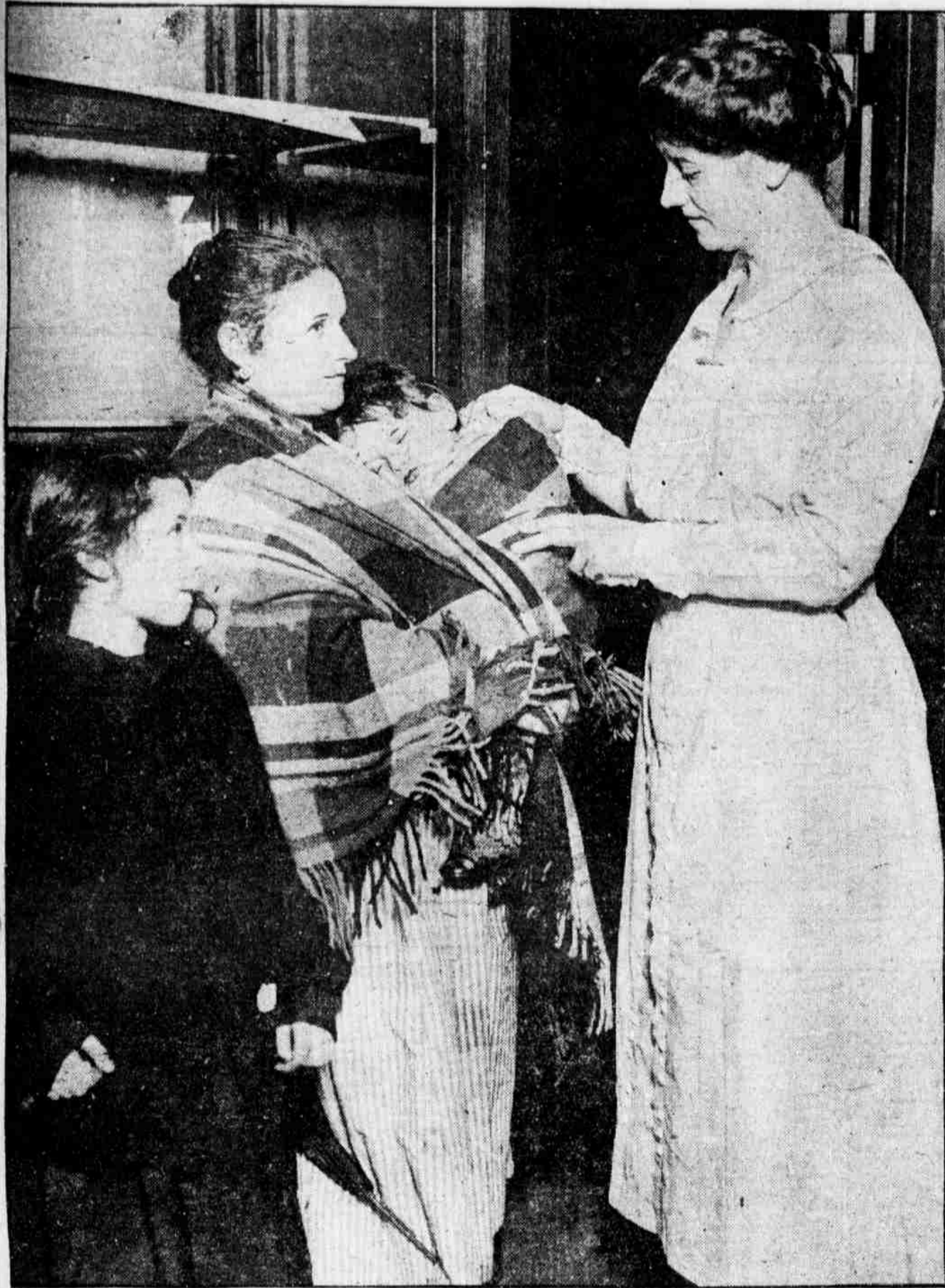
BABY wasn't ill, but the mother sought advice at the Phipps Institute, Seventh and Lombard streets, to make sure.