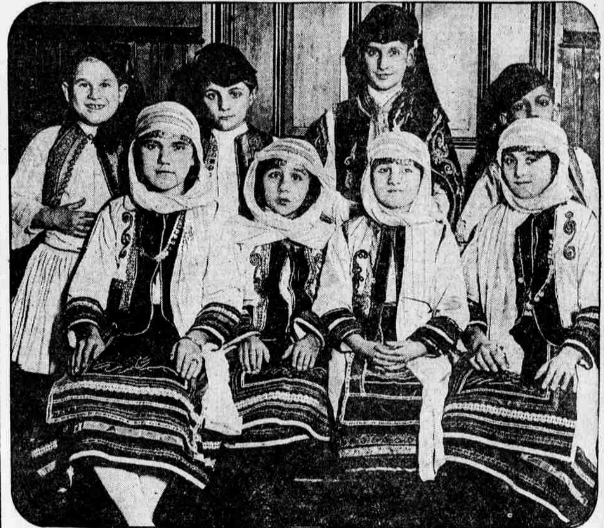
CHILDREN of the Greek Orthodox Community, 745 South Twelfth street, at the educational meeting in the diocesan church of St. Mary, Broad and South streets, yesterday.