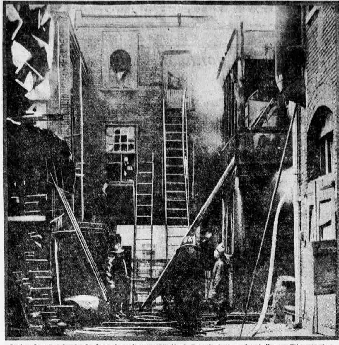
Student firemen today fought flames in a plant at 2047 North Seventh street, under similar conditions to those at the fire in the Addison street factory Monday, where six men lost their lives. Today's blaze caused damage amounting to $25,000. Several employes had to fight their way to safety

century since socialism became as much a matter of public reading and discus-