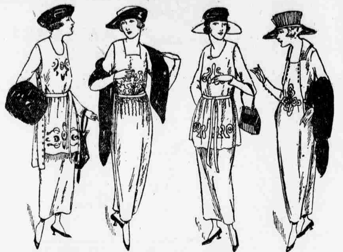
Four of the Models Illustrated