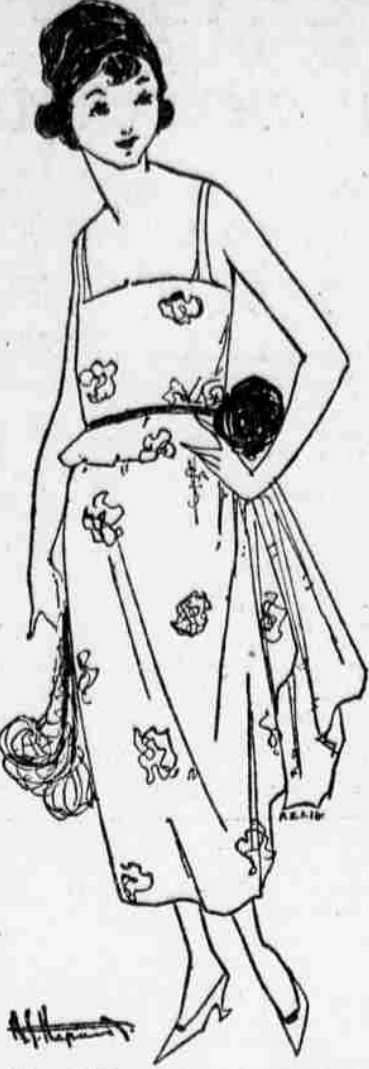
The striking contrast of a brilliant green feather against a brown tulle sash is the feature of this frock. But, take away both of these and you still have a dress that is pretty and becoming enough to suit any body.

eyes. In those dark, passionate depths there was first uncertainty; then a sudden wild realization. She rose up on her knees and then sank back. From that time on she was a different girl. Silent and unresponsive she accepted life, her small face utterly expressionless, her slim hands almost always folded in her lap as she sat and thought.