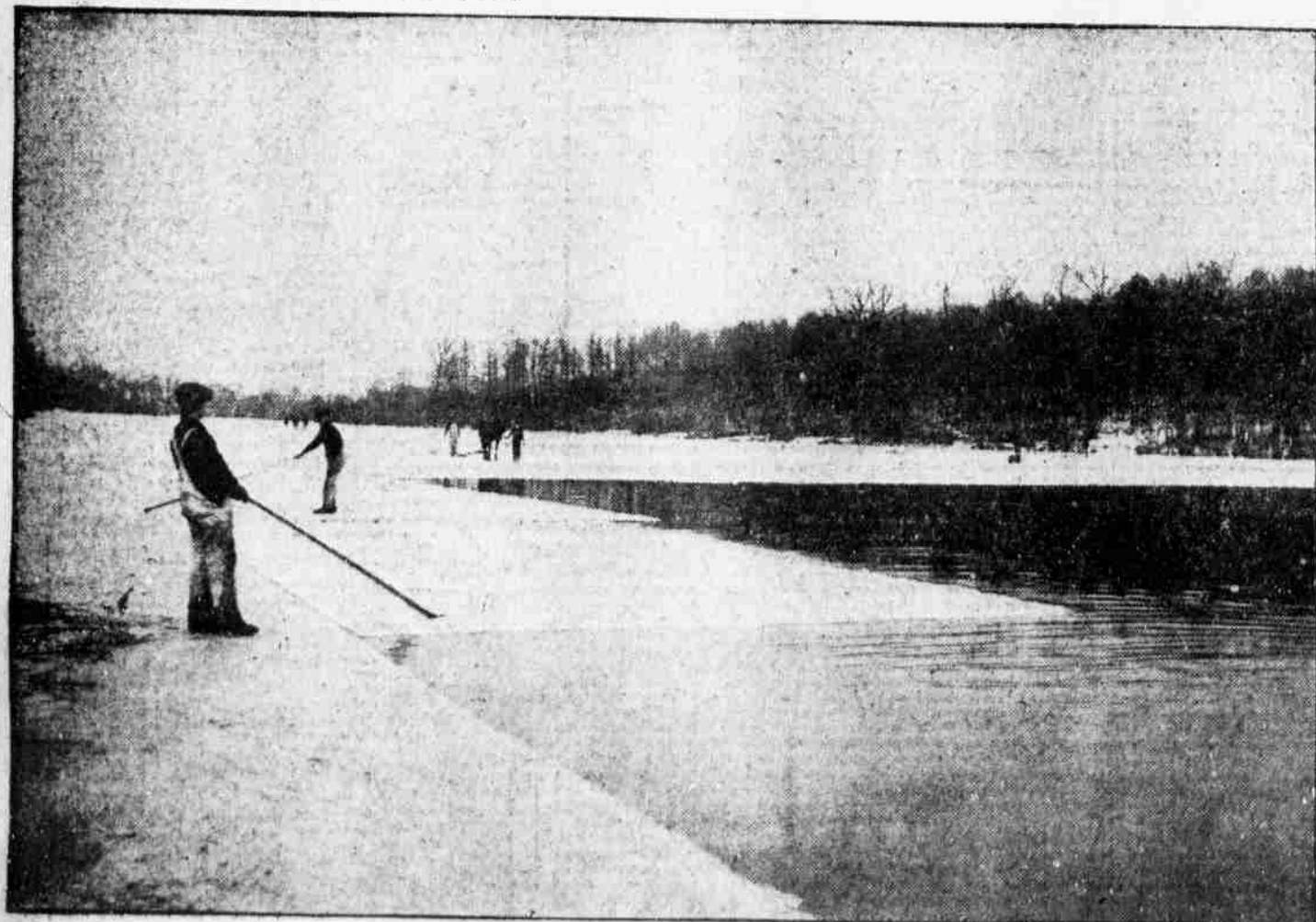
HARVESTING ICE on Perkiomen creek, floating ten and twelve inch cakes of ice down the stream to the storehouses to be stocked till summer, when the ice is shipped to Philadelphia.