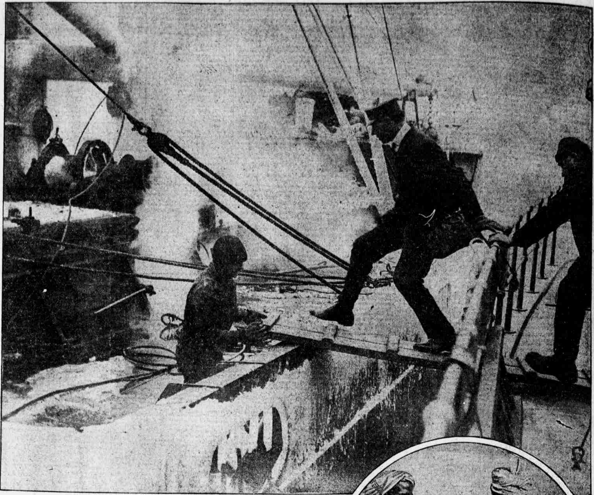
A CUSTOM INSPECTOR of the port of Philadelphia negotiating with all speed and skill the moving passage from the revenue cutter to an inbound ice-cooled steamer on the Delaware river.