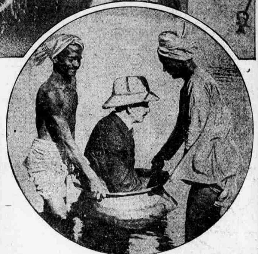
PASSENGER TRAFFIC in the East Indies—a two-man power skiff of one-man capacity not dependent on coal, gasoline or electricity to ferry passengers across the Far East stream.