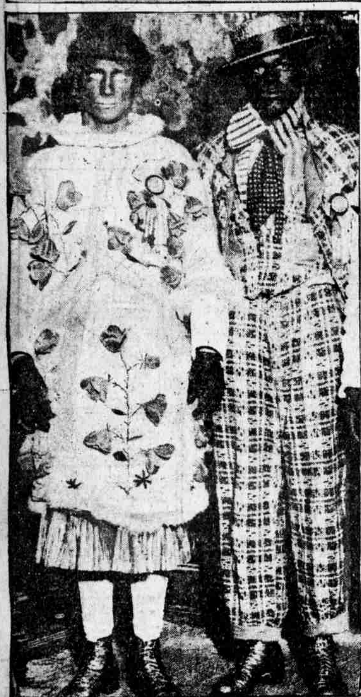
MINSTRELS of Silver Crown Club in parade array.

HERE'S MASTER NINETEEN-TWENTY! Welcoming the latest youngster of the century's growing family.