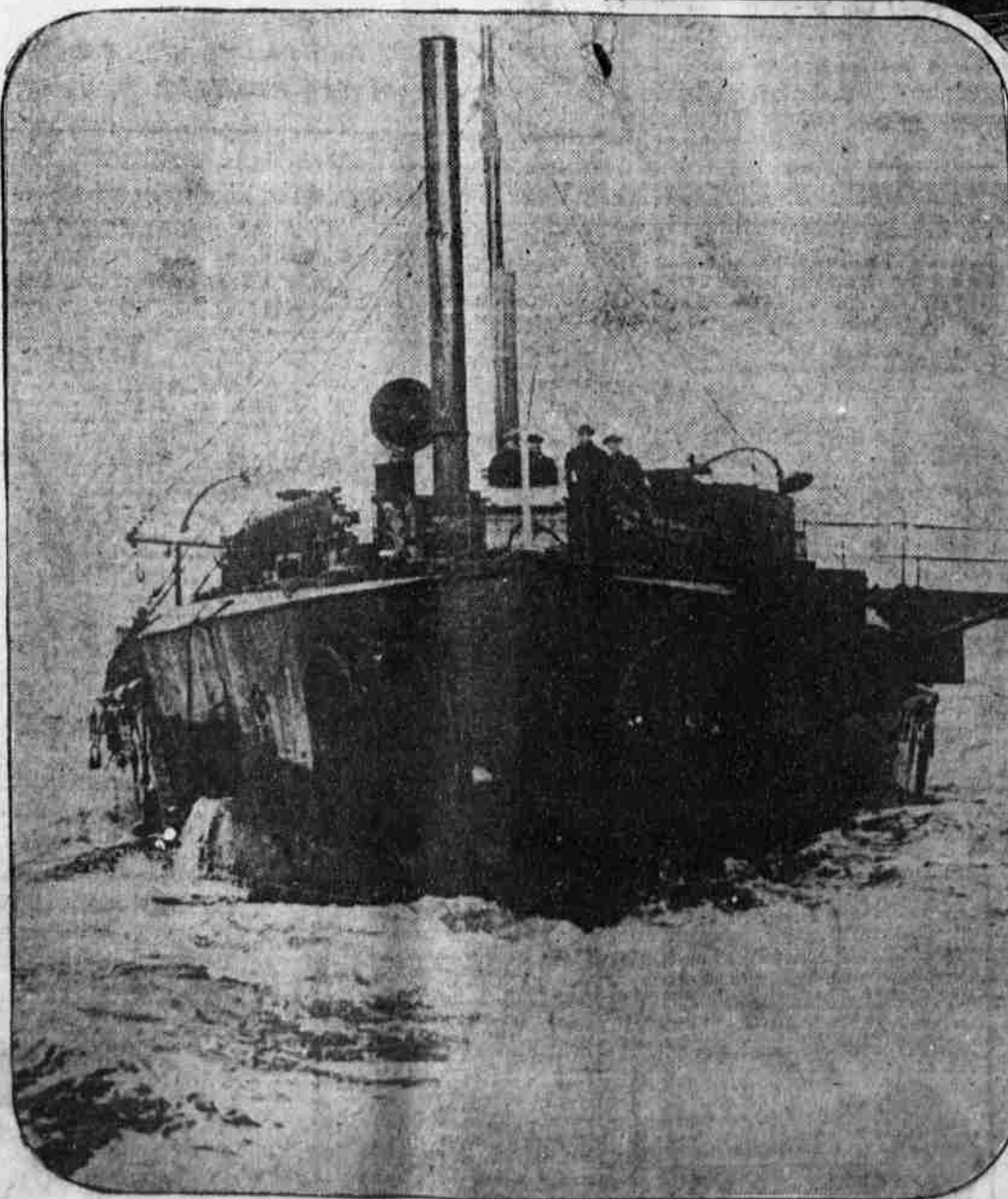
THE VINDICTIVE, filled with concrete and sunk to block Ostend harbor in one of the war's brilliant exploits, was completely wrecked by a big channel storm and battered to pieces. It had been hoped to salvage the vessel and keep it as a permanent relic.