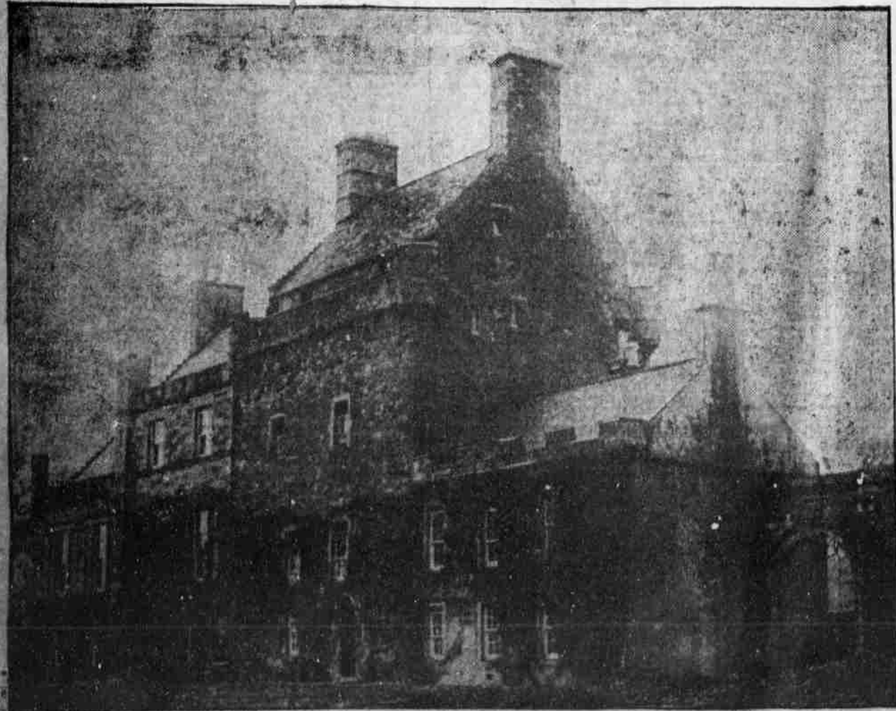
THE MANSION of Bernerayde, Berwickshire, England, ancestral estate of Earl Haig's family. The property is to be made a national gift to the commander-in-chief of Britain's Expeditionary Forces in France and Flanders during the war.