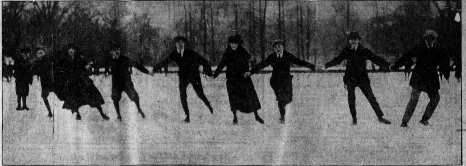
SWINGING OVER the ice on Gustine Lake, Fairmount Park. To the delight of skaters the thermometer's mercury continues to linger at its freezing quarters, giving the ice enthusiasts continued chances to enjoy the winter pastime.