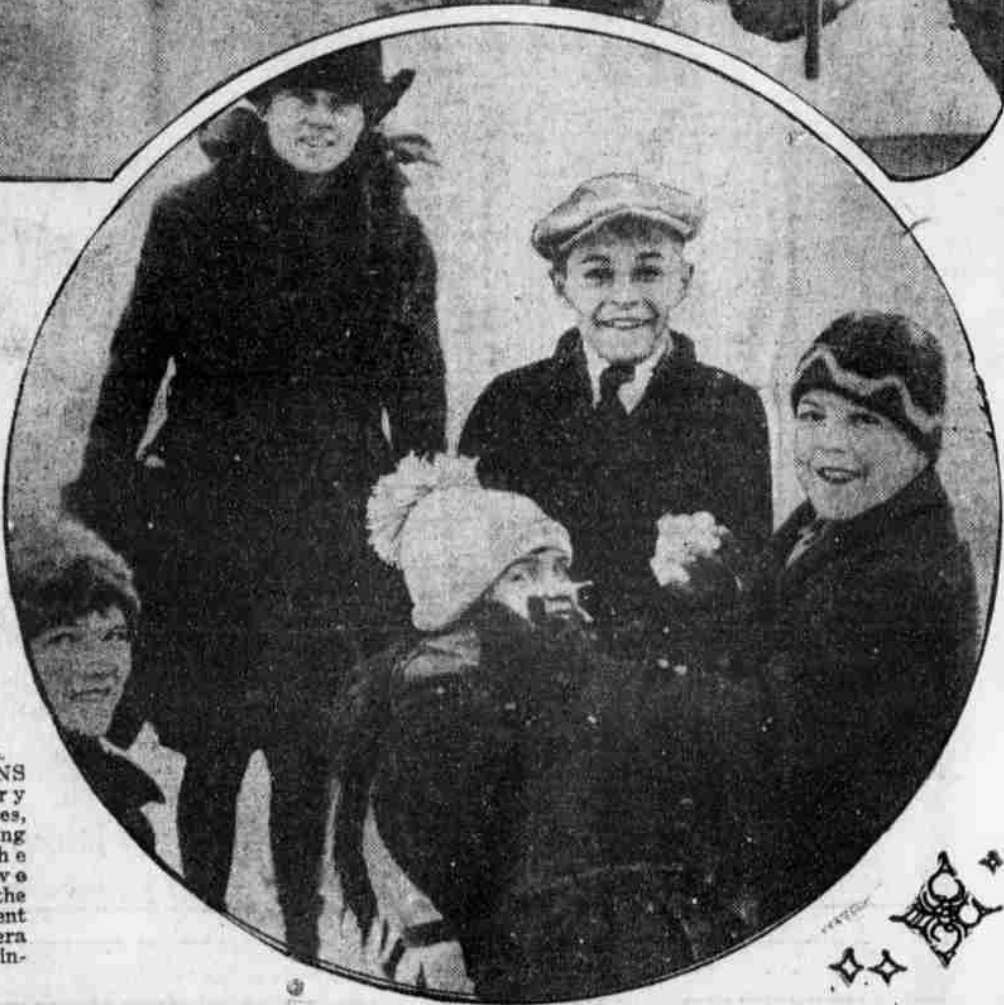
SNOW ABLUTIONS are usually very active performances, but here the young masseurs and the fair victim have obligingly halted the rites for a moment to permit the camera to register this winter ceremony.