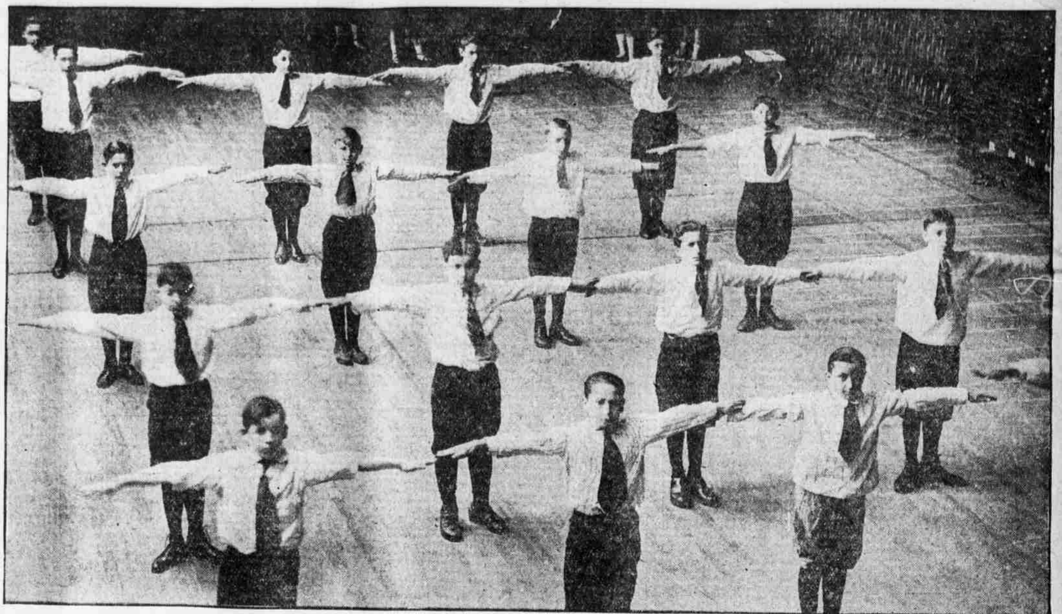
LOCAL PUPILS giving an exhibition of calisthenics in the gymnasium of the William Penn High School for Girls in a dance and drill review for the physical education section of the Pennsylvania State Educational Association in convention here.