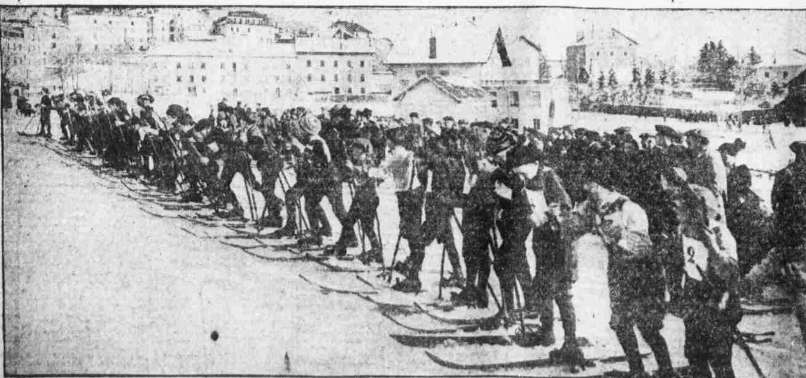
JUVENILE SKIERS ready for the start of the big event at the winter carnival at St. Croix, France, in the Jura mountains on the Swiss border. To be one of the contestants, even, in this race is held to be a great honor among the youthful population.