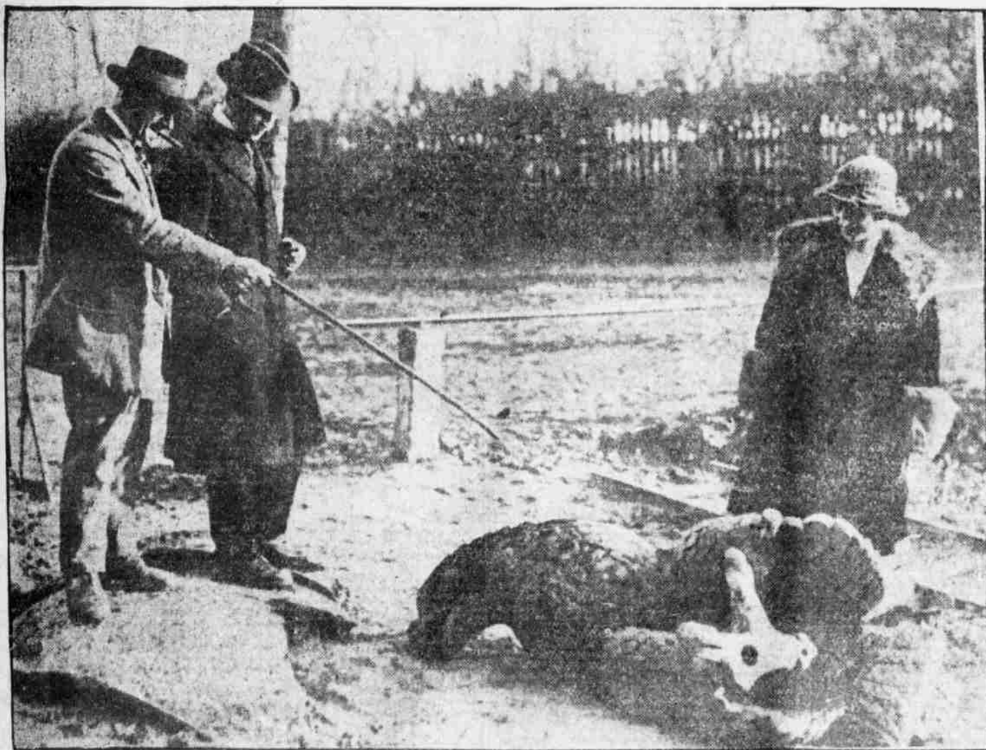
AN IMPERIAL German eagle modeled of iron, which came crashing down with other useless ornaments when the Germans blew up the great fort of Kuestrin, Prussia, in compliance with the armistice terms.