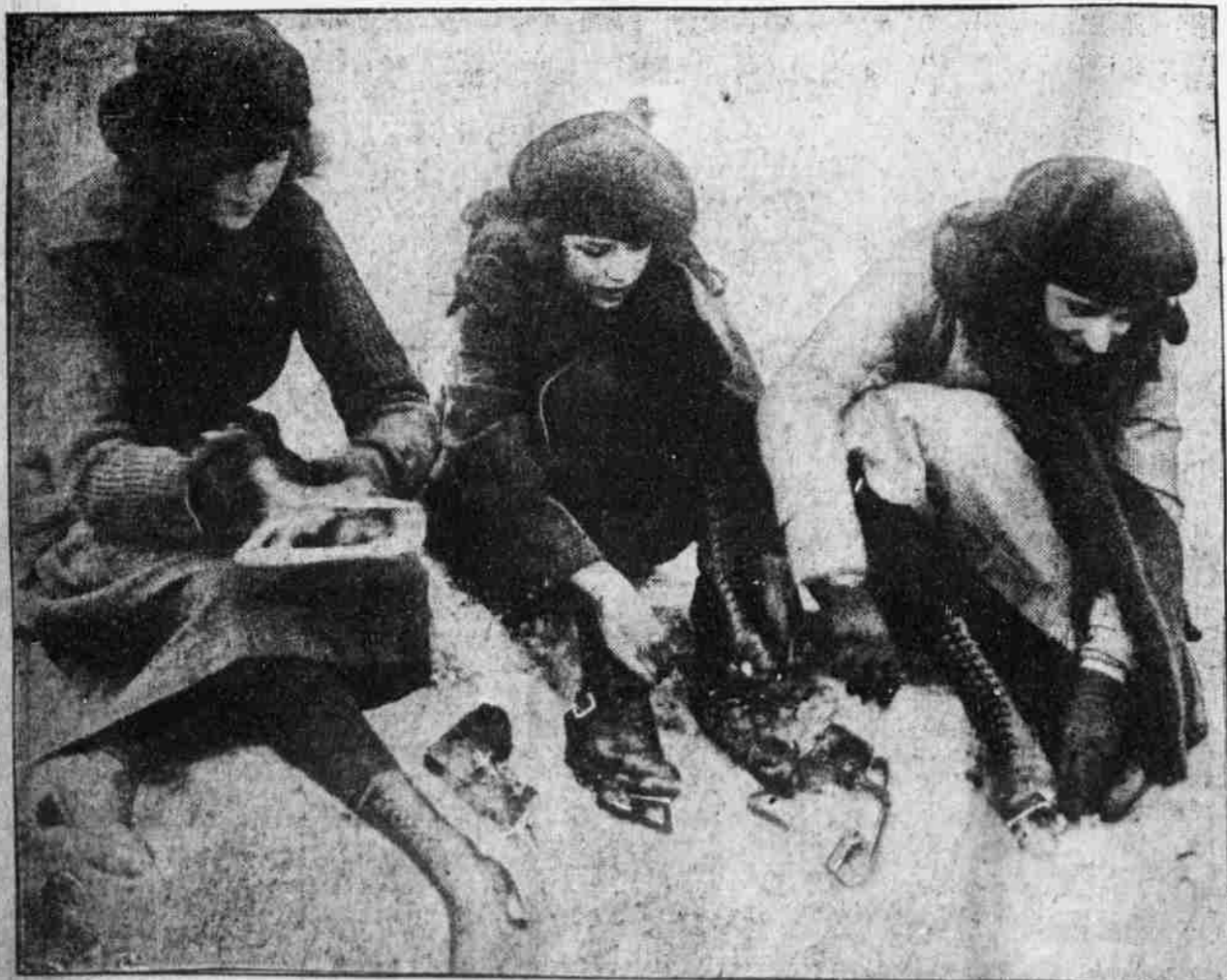
ADJUSTING THE clamps and straps firmly, and then for a spin over the frozen surface of the park's little lake.