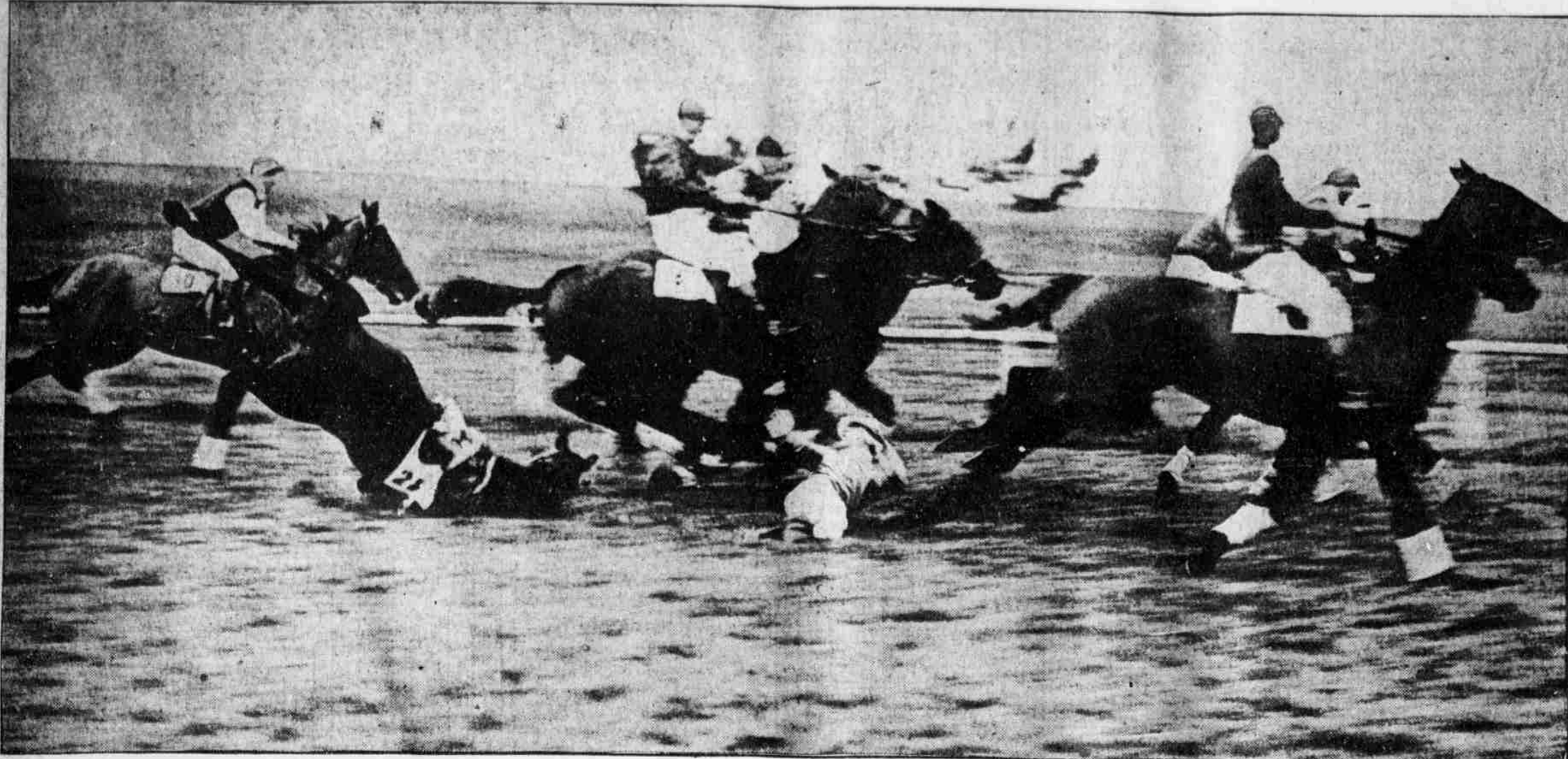
A REMARKABLE action picture of Captain Ian Straker landing on the racetrack after being unseated from his mount, Kirkale, in the Moyer hurdle handicap at Lingfield, England, while his horse is rolling over from the fall.