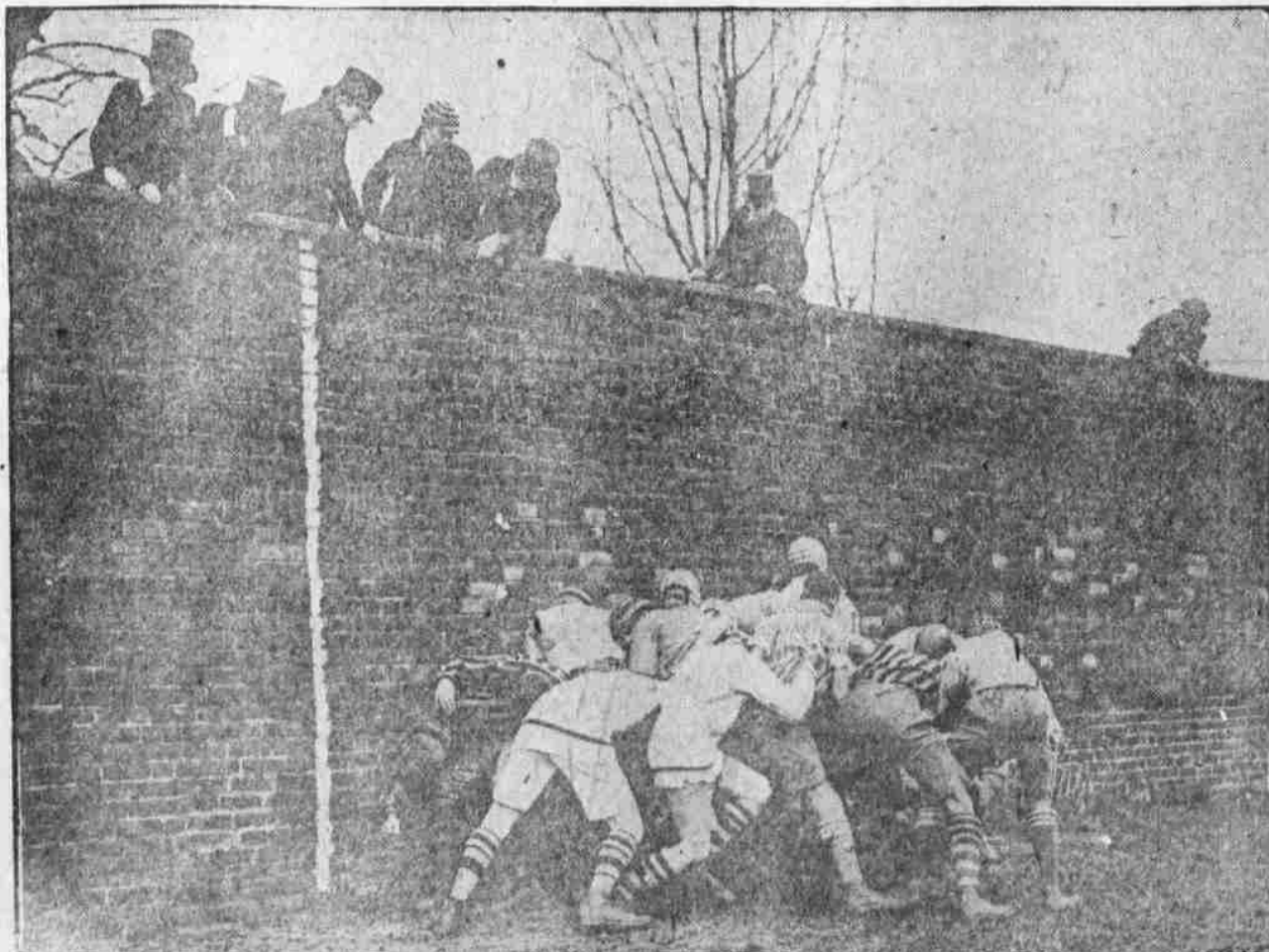
HOLDING THE BALL against the wall is the great feature of the well-known Eton College wall game. The contest is witnessed by the spectators from the top of the structure.