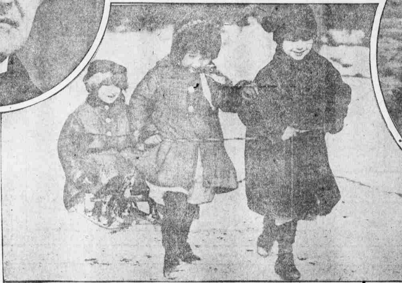
THE LITTLE red sled gets its initial try-out of the season. Youth mobilized swiftly at the first real snowfall of the winter.