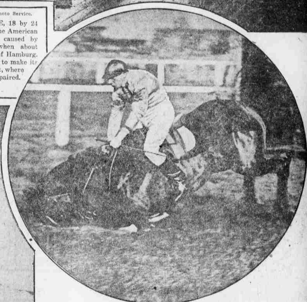
NEIL GIRL, ridden by Threlfell, falling after clearing a jump at the Newbury (England) races.