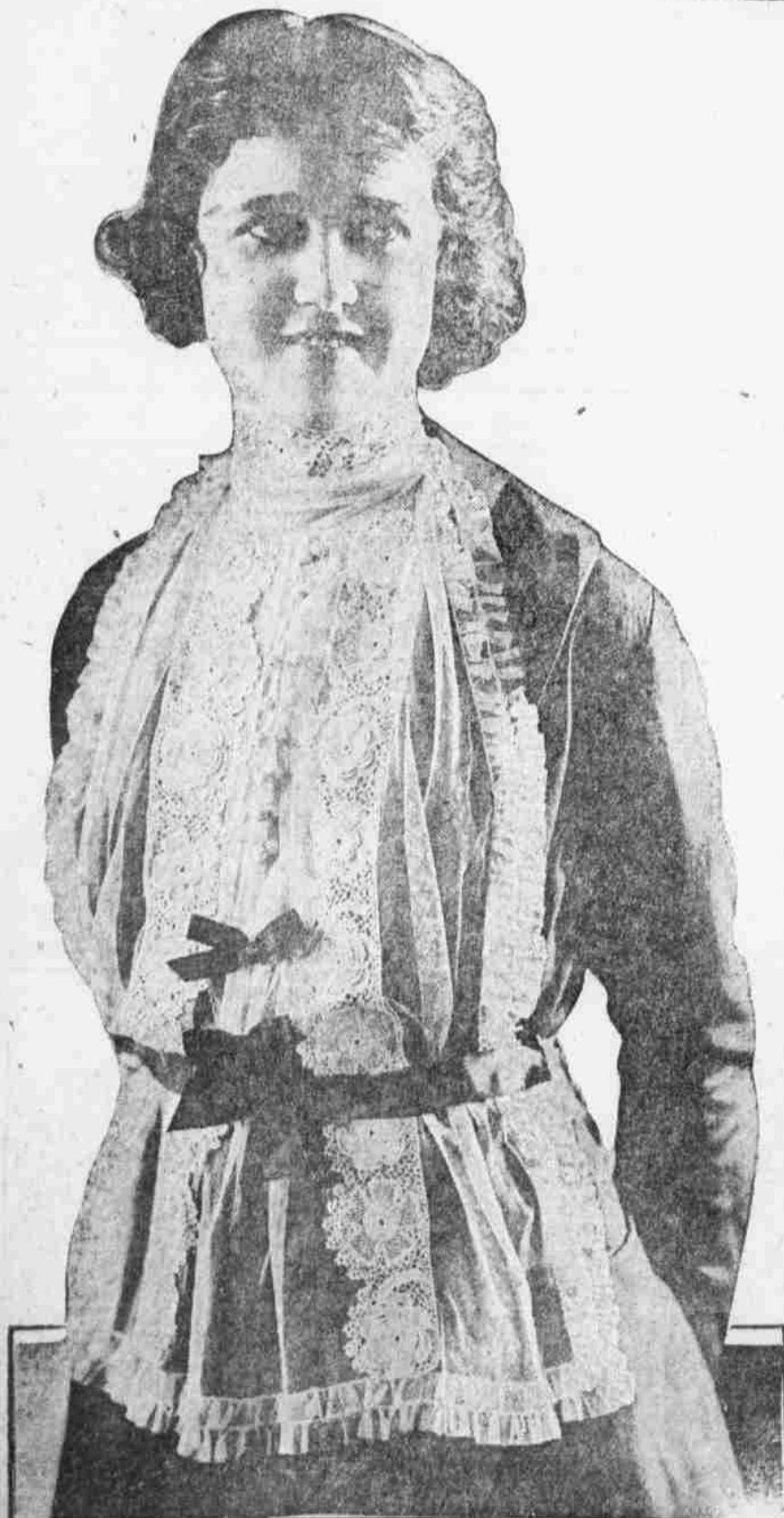
FASHION DESIGNERS work space. This smart venter is a new note in spring neckwear. It is fashioned in white net and baby Irish lace and Irish crochet buttons. Bows and girle are of black satin.