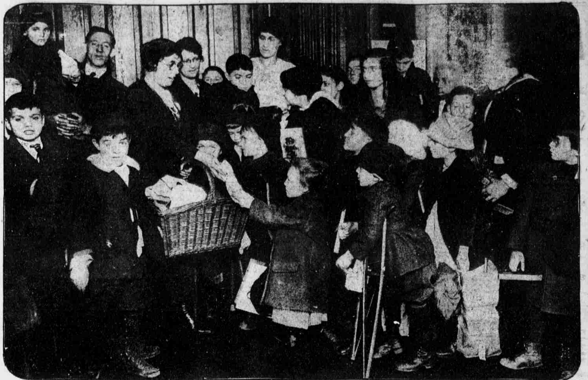
DISTRIBUTING THE McCall School pupils' Christmas gifts to crippled children at the Binney Annex, Sixth and Spruce streets. The little girl in the center receiving a holiday package is fifteen years of age.