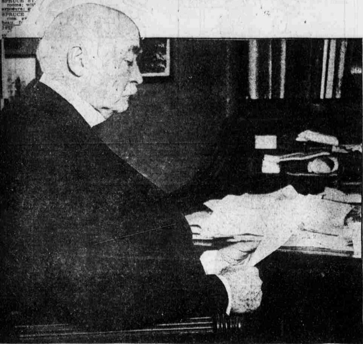
FORMER GOVERNOR EDWIN S. STUART, recently re-elected unanimously president of the Union League at the club's annual election.