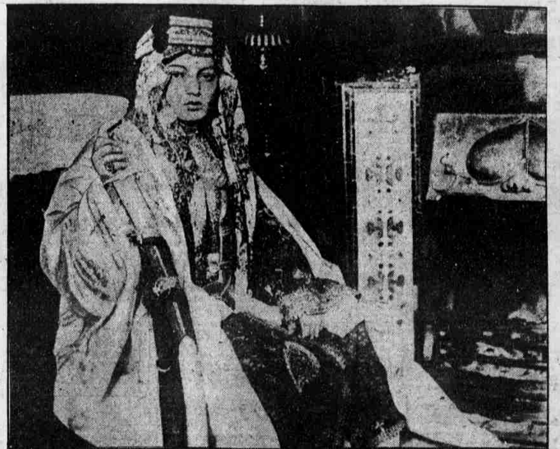
PRINCE ROYAL of Arabia, who is visiting all the principal cities of Ireland. Naturally he feels the effects of the cold, and when not officially engaged, spends his time close to the fire.