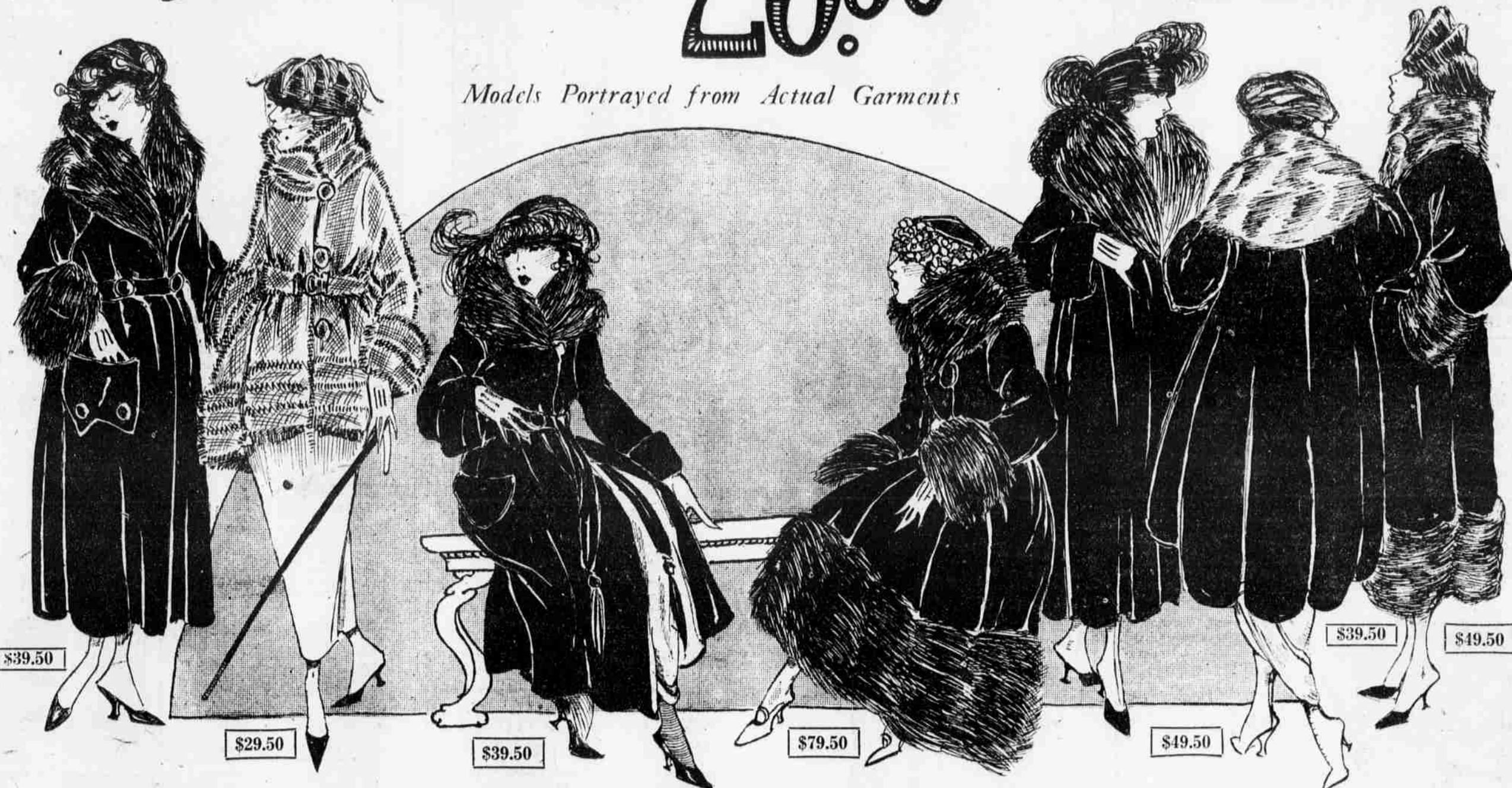
Models Portrayed from Actual Garments

1165 "Salt's" Peco Silk Plush Coats & Sports Coatees Regular $39.50 to $49.50 Values 29.50 Women's & Misses' Sizes