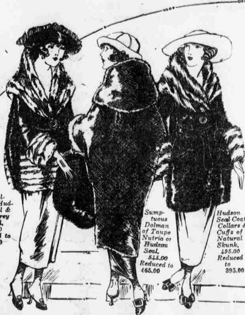
Semi Dolman of Hudson Seal & Blue Grey Squirrel, 445.00 Reduced to 345.00