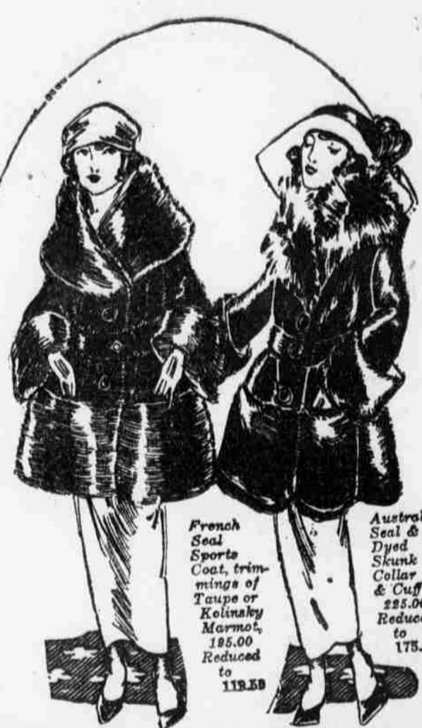
French Seal Sports Coat, trimmings of Taupe or Kolinsky Marmot, 185.00 Reduced to 119.50