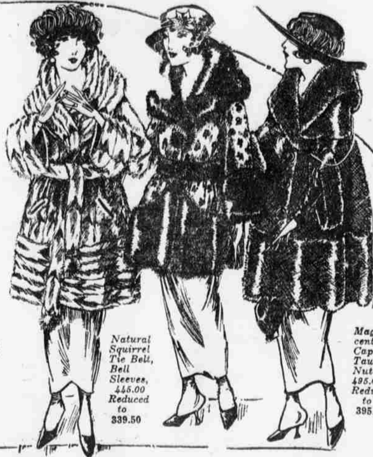
Natural Squirrel Tie Belt, Bell Sleeves, 445.00 Reduced to 339.50