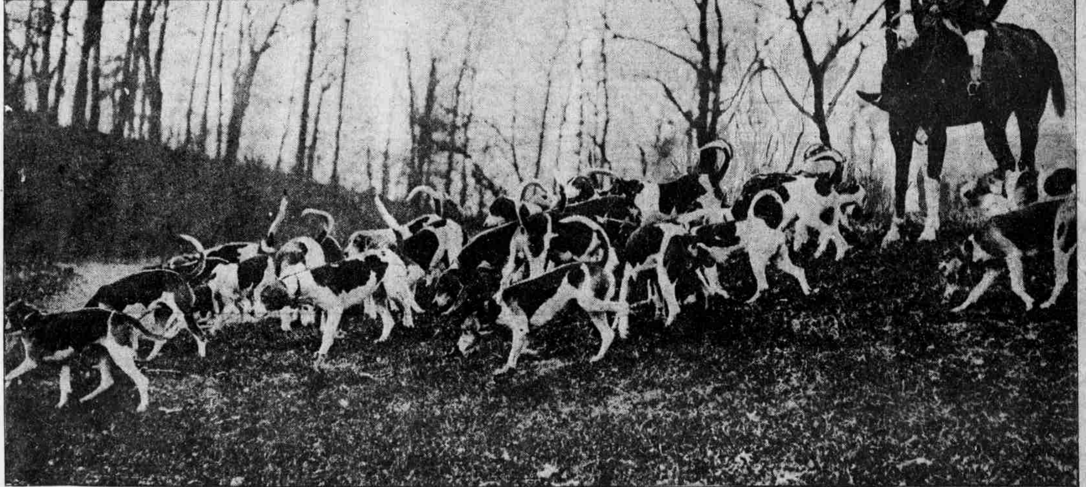
THE PACK of the Radnor Hunt Club. The annual Thanksgiving Day reunion between the riders of the club and the farmers and their families, over whose fields the huntmen pursue the speedy reynard, was renewed at the hunt club.