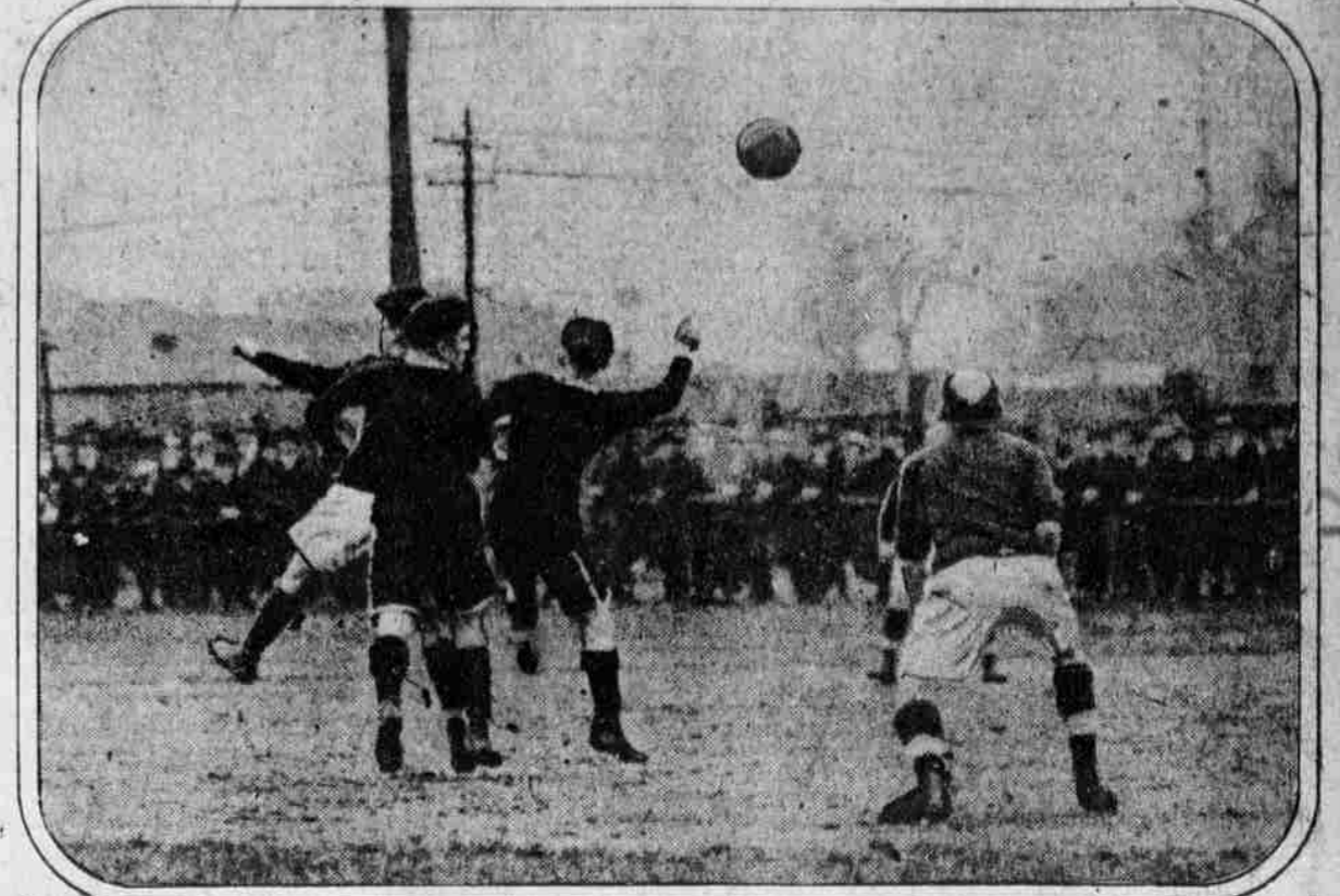
THE WANDERERS and Disston battling in the American Cup soccer match at Disston Park, State and Unruh streets, Tacony.