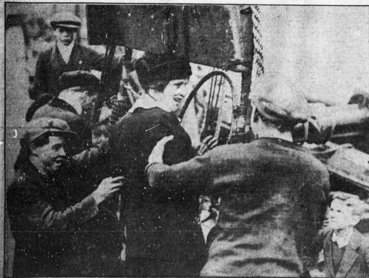
LADY ASTOR campaigning among the Plymouth fishermen during her speech-making tour for the seat in the House of Commons. Announcement made today that she had been elected as a Unionist over her Liberal and Labor opponents in the election held on November 15.