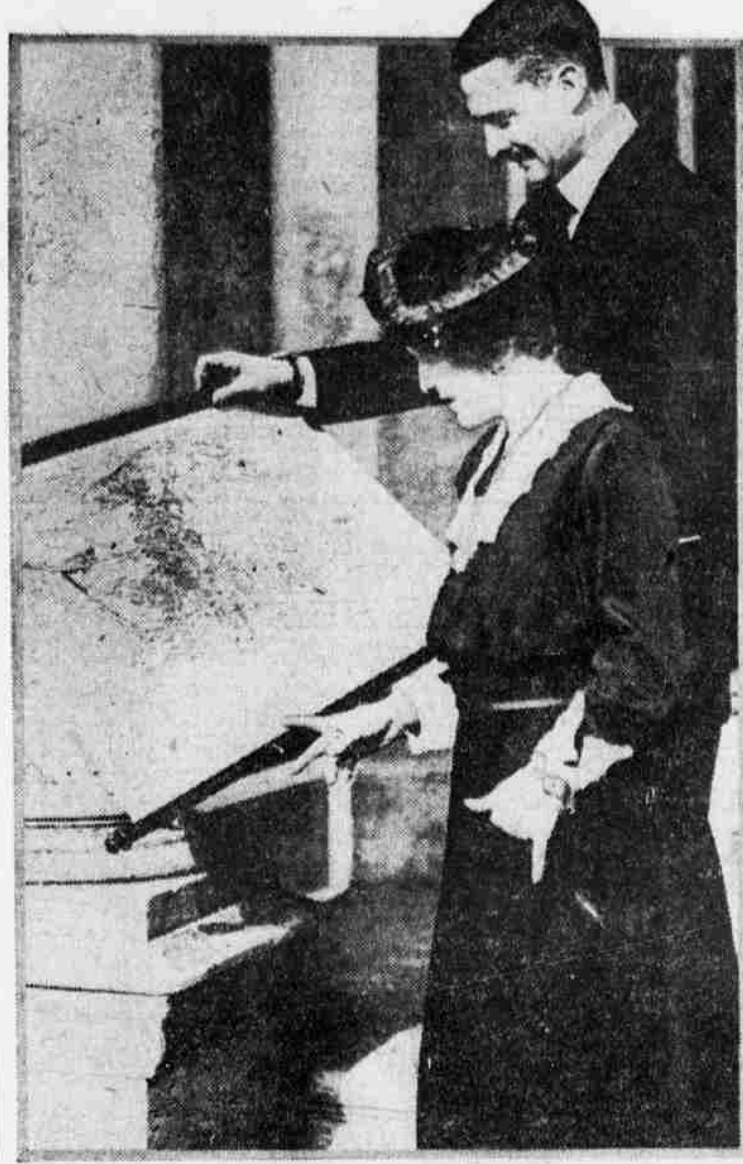
LORD AND LADY ASTOR. The American-born Viscountess and Viscountess looking over a map of the Plymouth district during her campaign for a seat in the House of Commons. She was elected as a Unionist by a majority of 1004 over the Labor and Liberal candidates. The election was held on November 13.