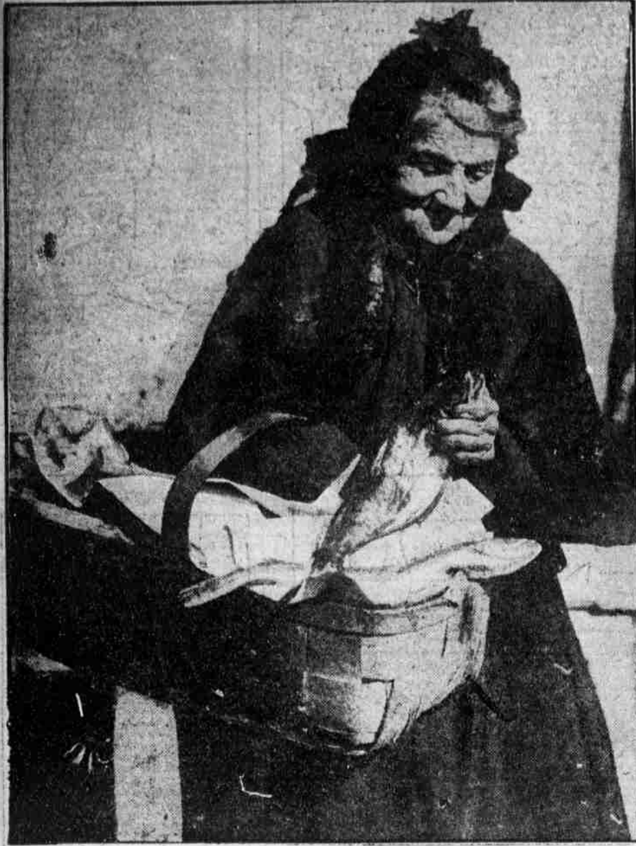
CARRYING HOME a few of the 1000 pounds of fish which a local dealer distributed to encourage the eating of fish, so as to strike a blow at the high cost of living while stimulating the fish business.