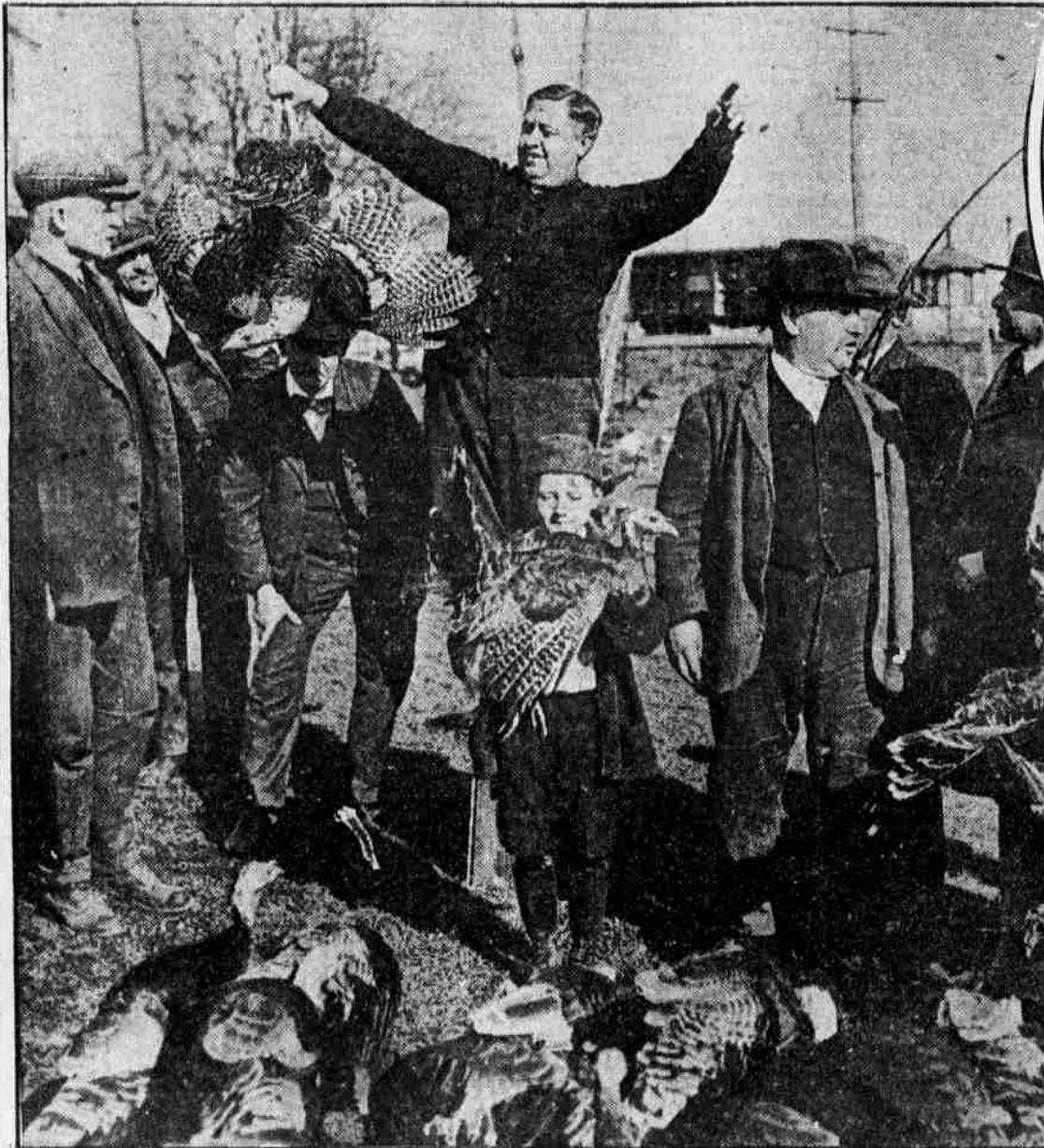
AUCTIONING TURKEYS at South Hatfield, Pa. Thanksgiving birds, according to poultry dealers, are less numerous than usual. Live turkeys are bringing from 35 to 40 cents a pound wholesale.