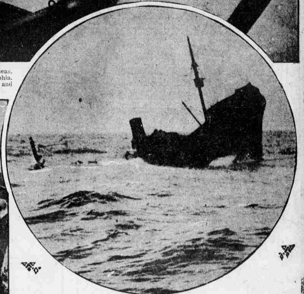
THE CARGO carrier Daram, sailing from New York late in August, struck a coral reef off Bermuda. While being towed to an anchorage by two Bermuda tugs the vessel sank stern first. Crew and officers were taken off by the tugs, which stood by as the ship plunged under the sea.