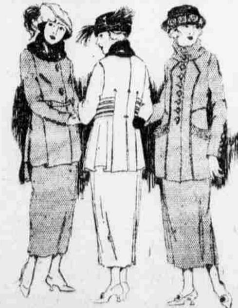
Three Smart Models at $22

Misses' Sizes, 14 to 18 Years—Women's Sizes, 36 to 46 Bust