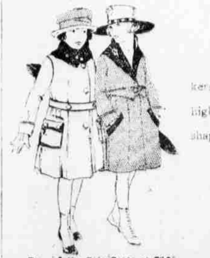
Two of the Sale Coats at $21.75