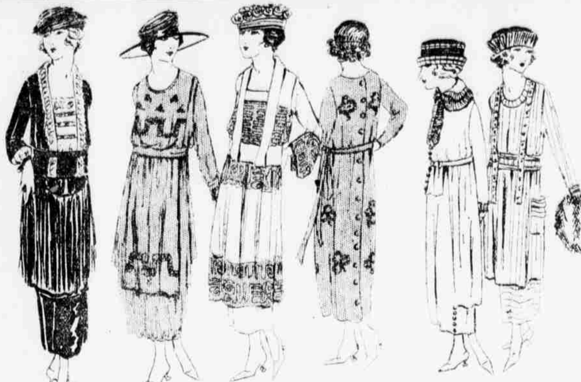
Women's Dress at $28 Women's Dress at $18 Women's Dress at $38 Misses' Dress at $18 Misses' Dress at $28 Misses' Dress at $38