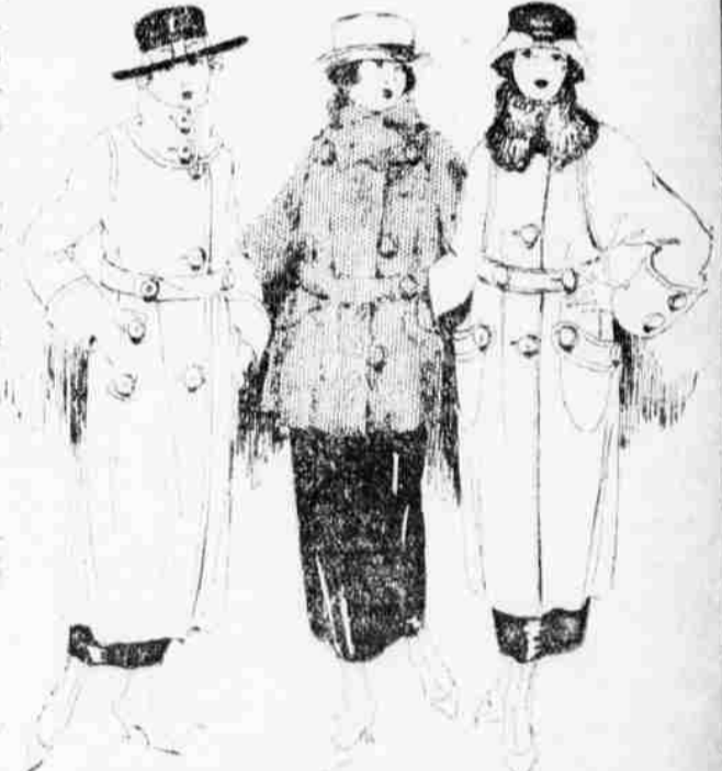
At $21.75 At $21.75 At $21.75