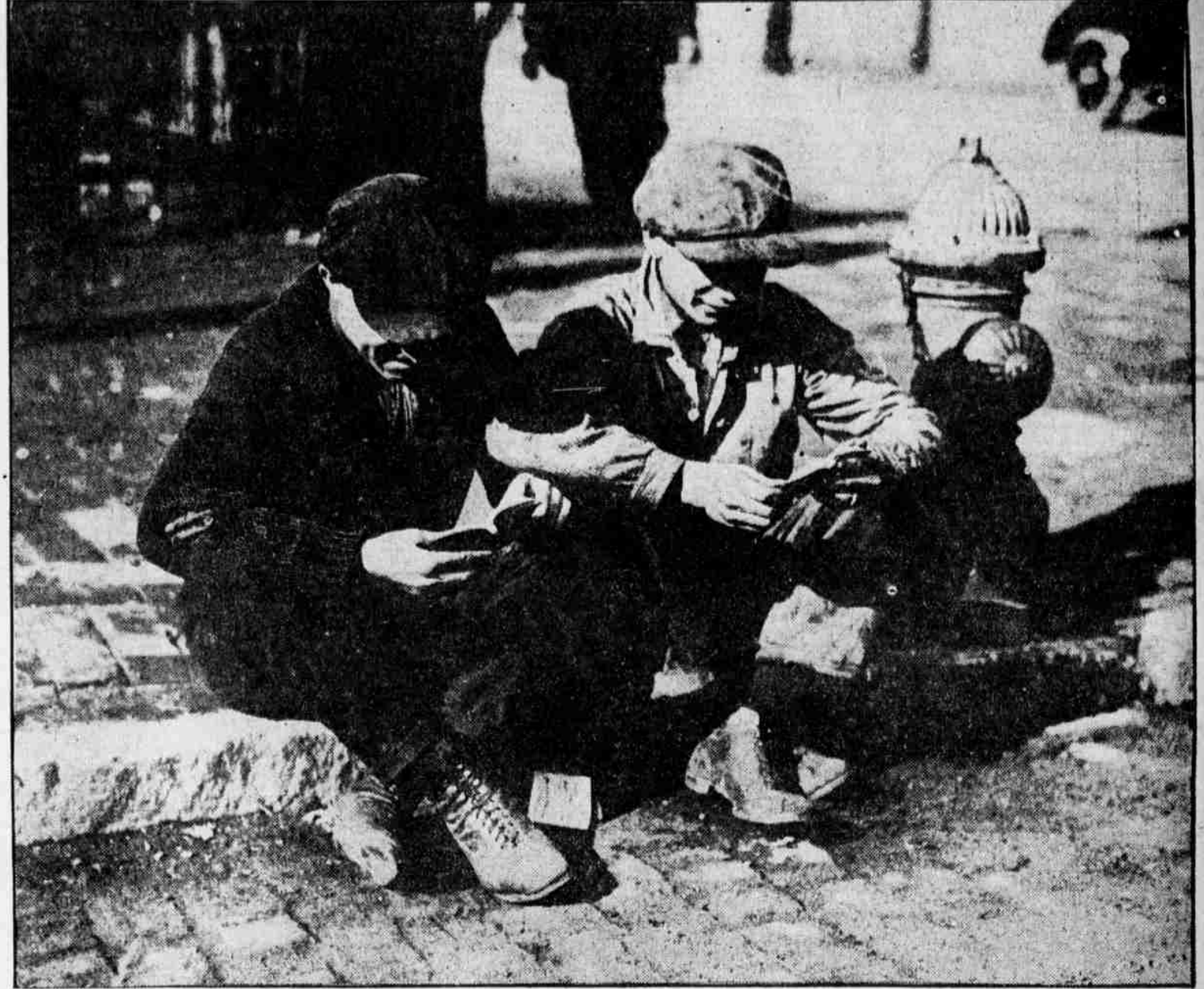
SHIPWORKERS AT Cramps' yard examining the little Testaments received from the Pocket Testament League. Many thousands of copies of the Scripture were distributed to soldiers at the battle-front by the league during the war.