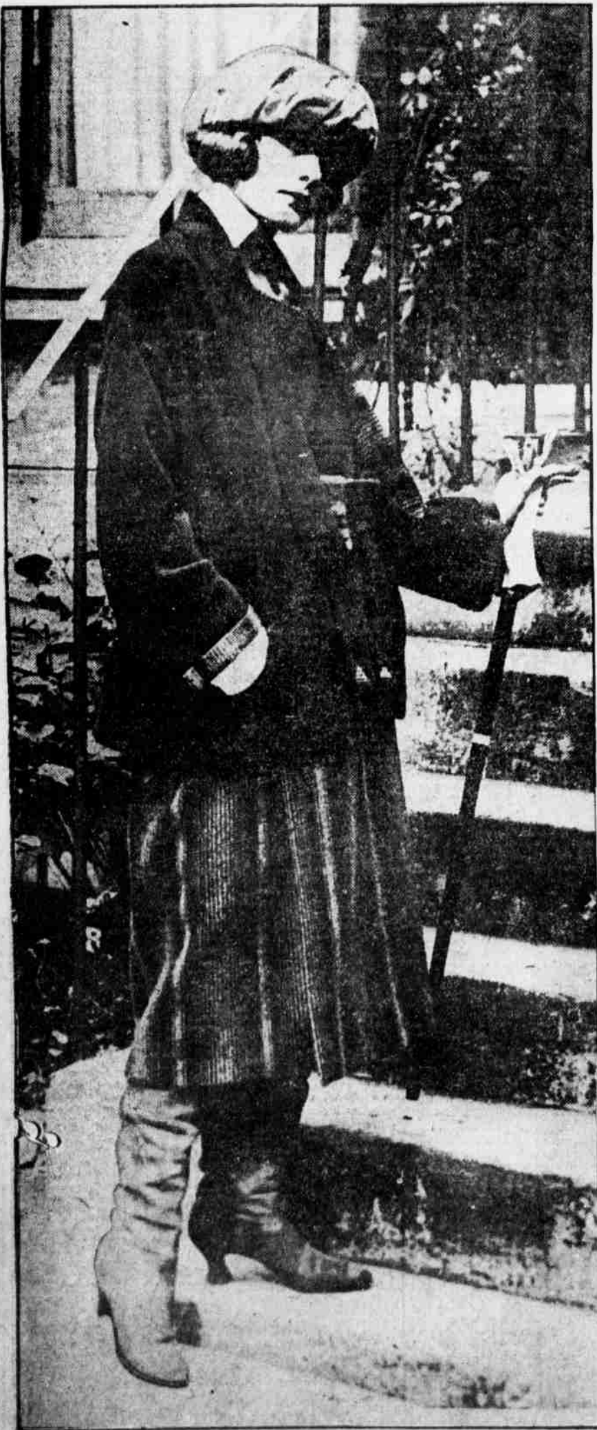
BOOTS ARE the London vogue. This winter costume has a coat of dark blue gabardine with a striped skirt of the same material and a white silk blouse.