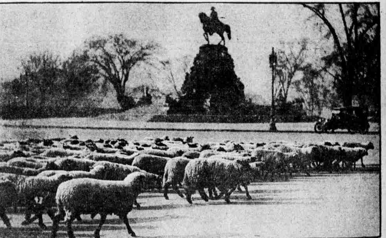
LIKE A painting by Anton Mauve — a flock of sheep on the Parkway at the entrance to Fairmount Park