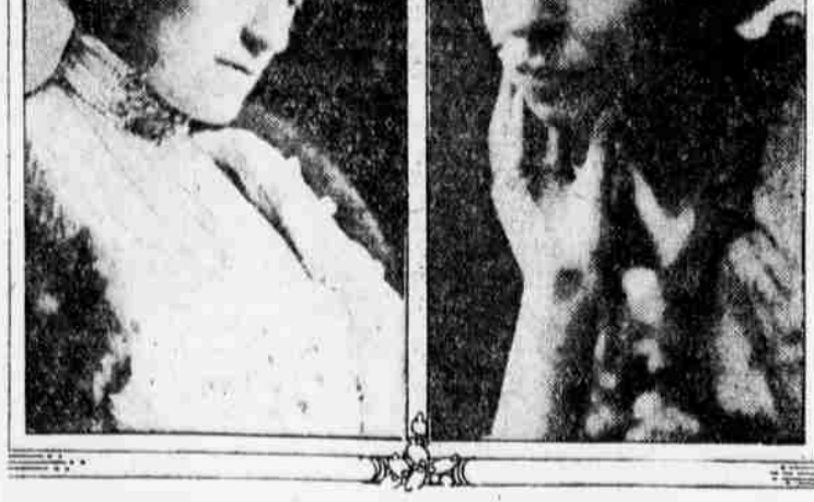
EDITH WHARTON AND PHYLLIS BOTTOME Who have written of various phases of war and its reactions on people