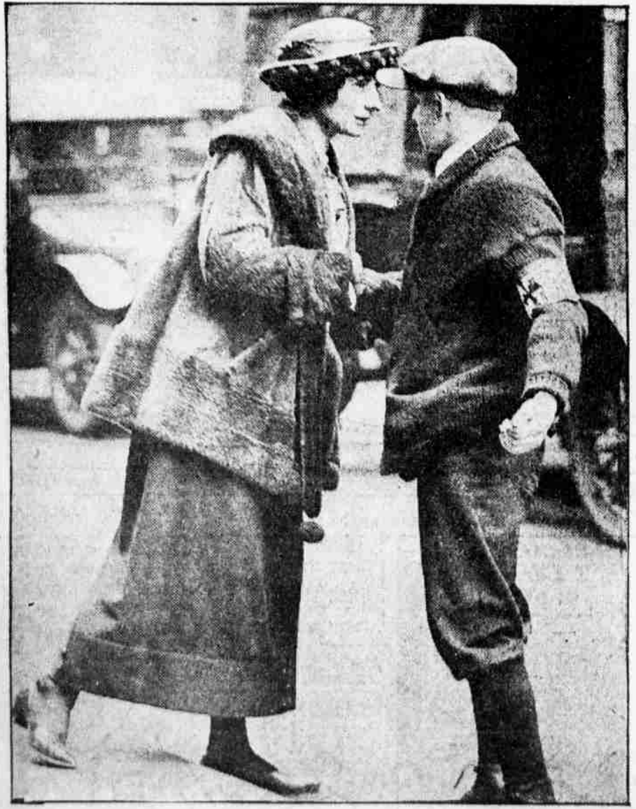
A SAFETY PATROL schoolboy doing duty as a traffic policeman at Broad and Chestnut streets, warning a pedestrian to cross the street at the crossing in the campaign for safety on the city's highwaya.