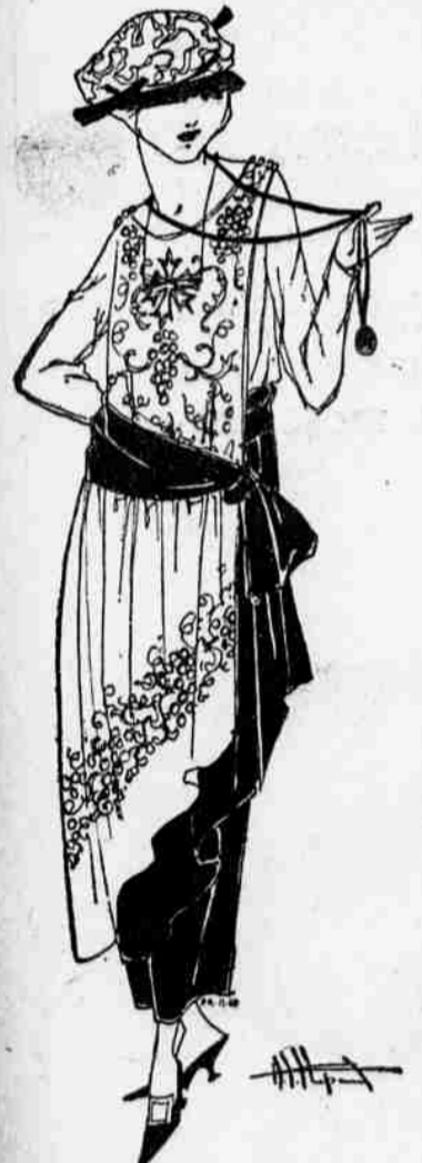
The foundation of this dress is black crepe meter. The bodice and tunic are of embroidered georgette crepe.