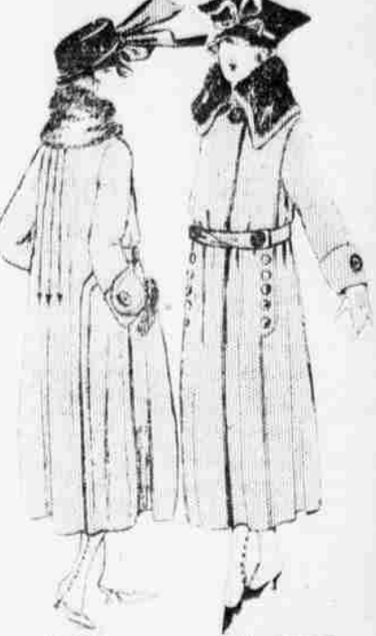
At $68 Save $29.50 At $47.50 Save $27.50

Silverstone—Silk lined throughout. In the lavender shades—maduro and black. With fur-trimmed collar of fur—chosen from natural raccoon and taupe nutria.