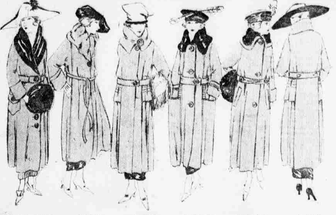
At $47.50 Save $27.50 At $58 Save $31.75 At $68 Save $29.50 At $42.50 Save $22.50 At $42.50 Save $22.50 At $58 Save $31.75

At These Remarkable Prices: $42.50, $47.50, $58 and $68 Savings $22.50 to $31.75