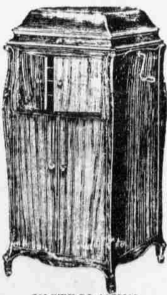
VICTROLA XVI Mahogany or Oak $250