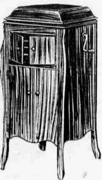
VICTROLA X Mahogany or Oak $110

Broad & Columbia Ave. | Open | 52d & Chestnut 4038 Lancaster Ave. | Evenings | 5610 Germantown Ave.