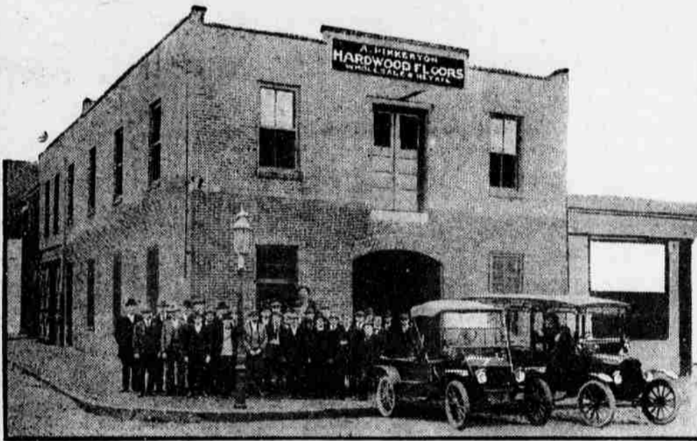
(This Picture Shows a Part of Our Staff of Experts)

OUR equipment and resources are far superior to any other concern of a similar character in Philadelphia. Our staff of workmen are all English-speaking men and thoroughly experienced, some of them having been engaged in this work for thirty years.