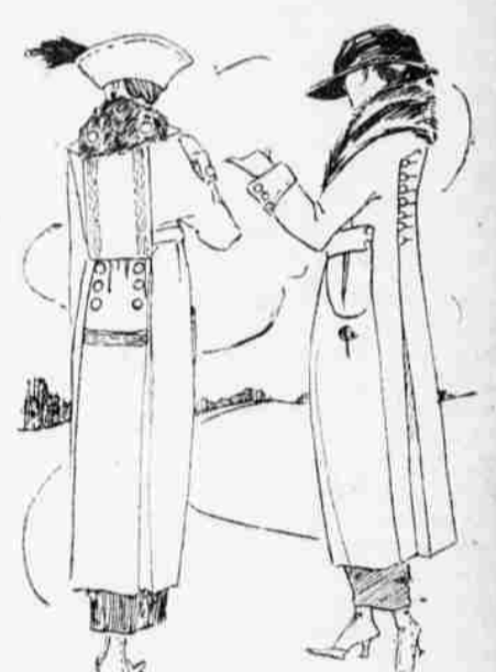
$57.50 $68.50 (Market)

are in all the handsome materials of the season, many luxuriously trimmed with furs. Some beautiful evening wraps are included at these prices.