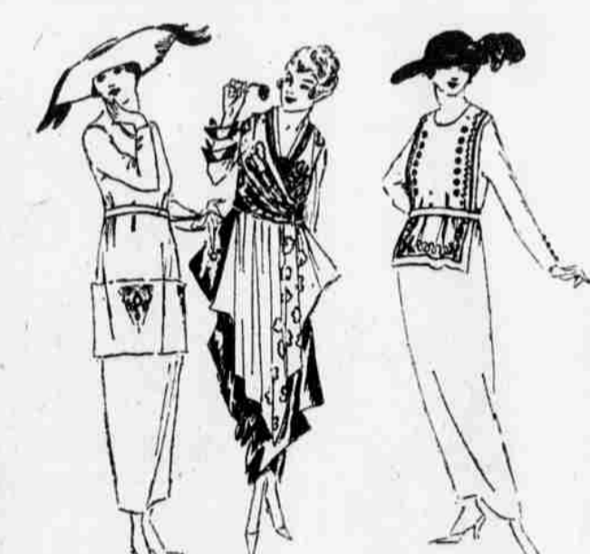
$15 $29.50 $15 (Market)

It's a story of low prices on smart and wearable frocks for the pleasant incidents of a Winter day.