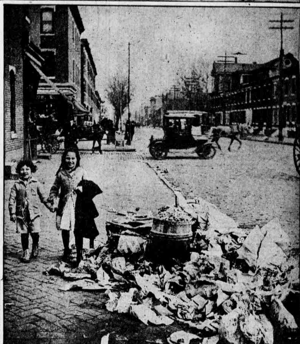
ASH AND GARBAGE collectors have again resumed their rounds. The Sixth street and Snyder avenue view above is typical of many localities where no collections had been made for more than a week because of the teamsters' strike