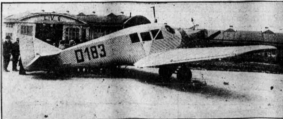
A FIREPROOF trade airplane. Germany has manufactured an all-metal machine, built to carry six people. In contrast to other planes this one has no spans.