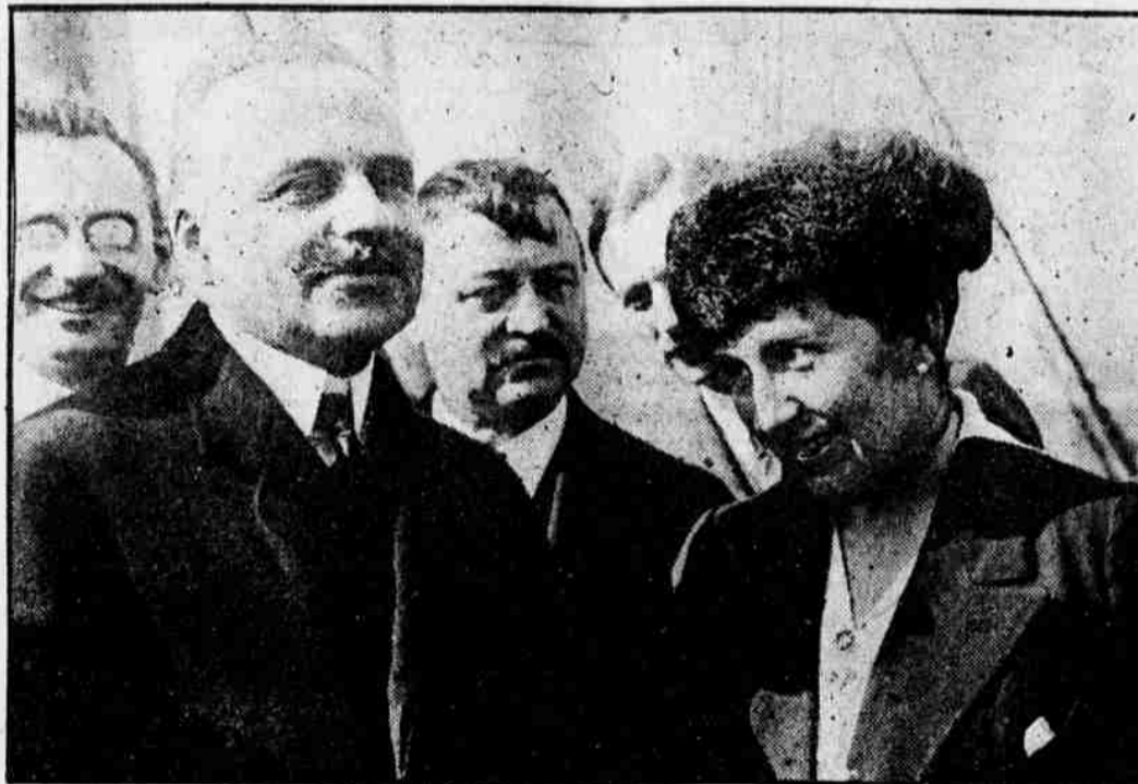
PRINCE CASIMIR LUBOMIRSKI, first Polish minister to the United States, and his wife, arriving in New York on the steamship America.