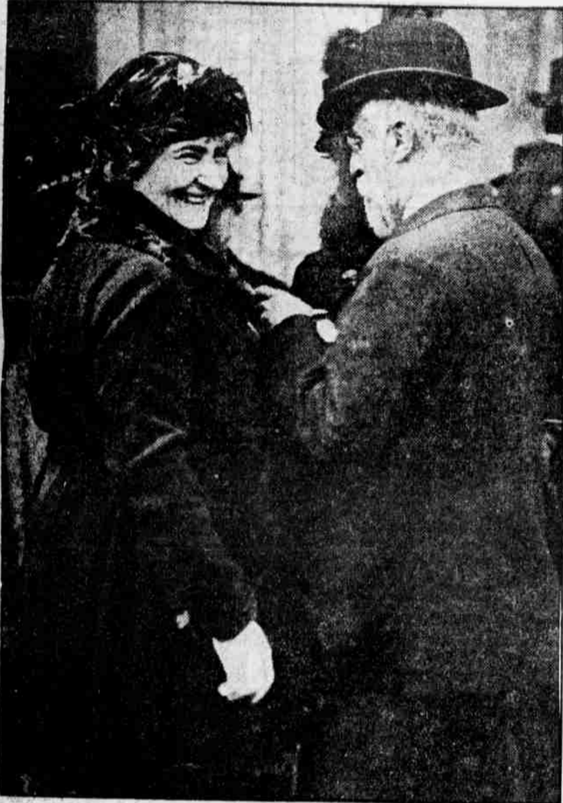
MISS ANNE MORGAN, daughter of the late financier, chatting with her brother-in-law, Herbert Satterlee, after her arrival in New York from overseas war service in France.