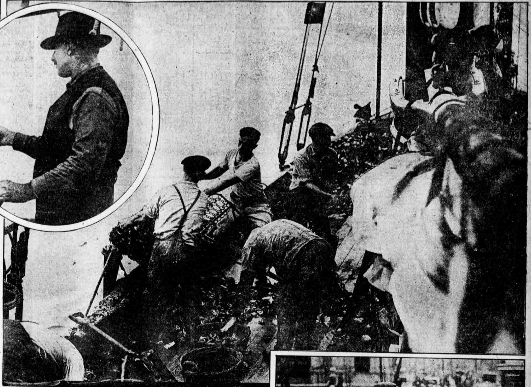
SEAFOOD EPICURES contend that the most toothsome oysters begin to reach this city during the last week of October, a period they have nominated as National Oyster Week. This Delaware Bay oysterman is busily at work supplying an essential feature of the celebration.