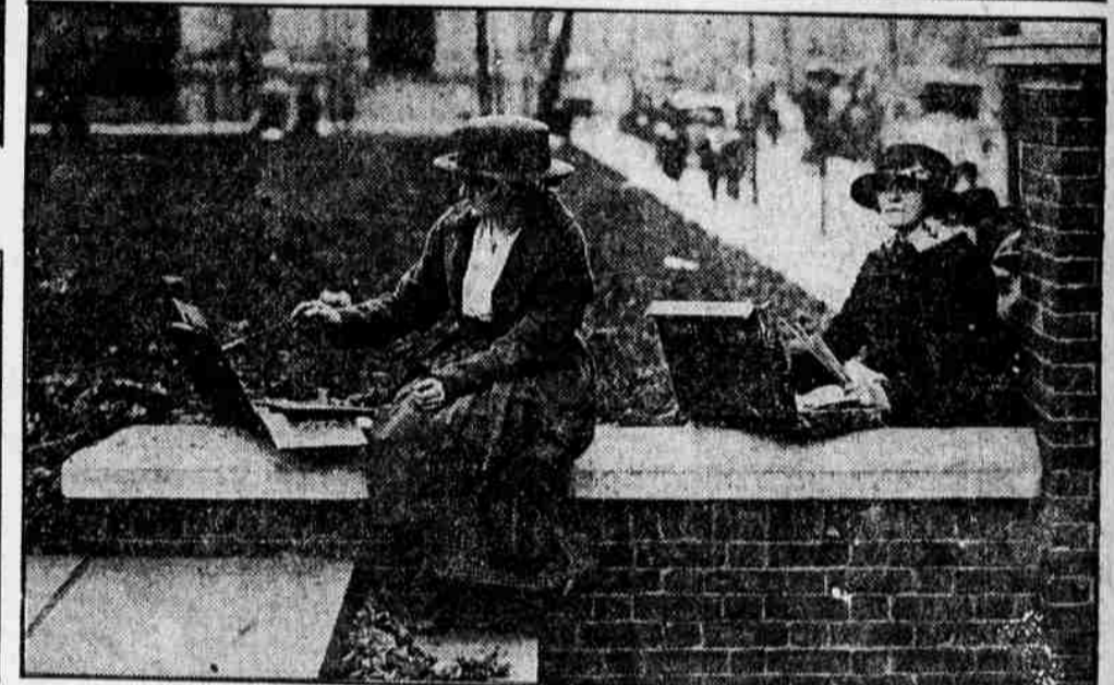
ART STUDENTS on the low wall at Independence Square, sketching the south side of the old State House in its colorful autumnal setting.