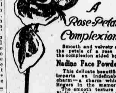
A Rose-Petal Complexion

All uncertainty is removed from baking by the use of the new-fashioned