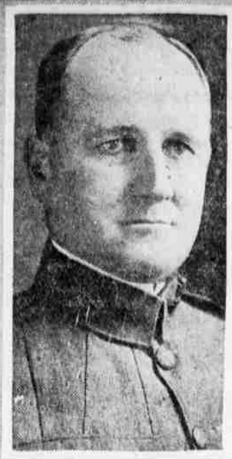
MAJOR GENERAL HARBORD Head of United States mission to Armenia, who is back at Constantinople, after narrowly escaping capture by bandits near Mount Ararat

By the Associated Press London, Oct. 23.—The Bolshevik forces have been flung back to the Kamyslin section (on the Volga, between Saratov and Tsaritsyn), losing 3000 men, taken prisoners, and many machine guns, according to a wireless communication from General Denikine. Extremely fierce fighting is reported in that district.