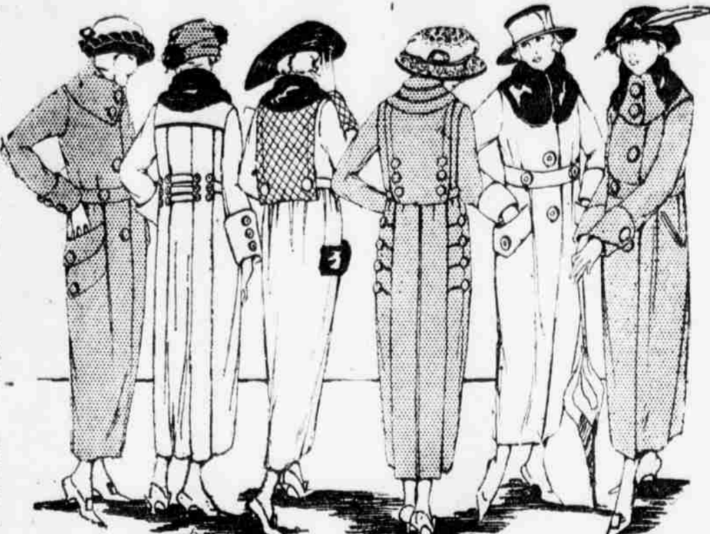
At $29.50 At $29.50 At $29.50 At $29.50 At $29.50 At $29.50

And collars—more than half with deep chin chin and shawl collars of sealene and kit coney furs—and the other half with large muffler and cross-over collars.