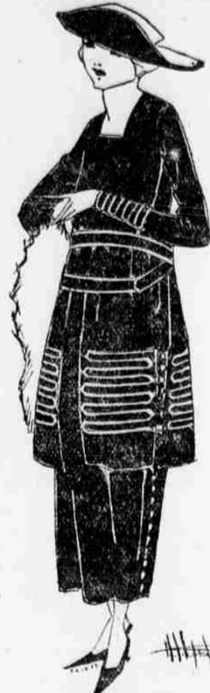
The all-black costume is just a little too somber for the young person, but it is charming if lightened a trifle with a white kid hat like the one in the drawing.