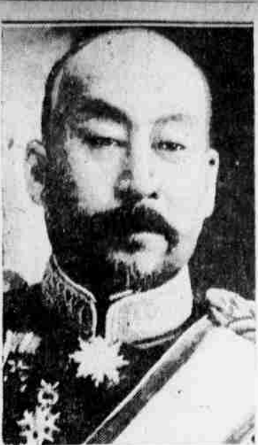
COUNT SEIKI TERAUCHI Field marshal and former premier of Japan, who died yesterday