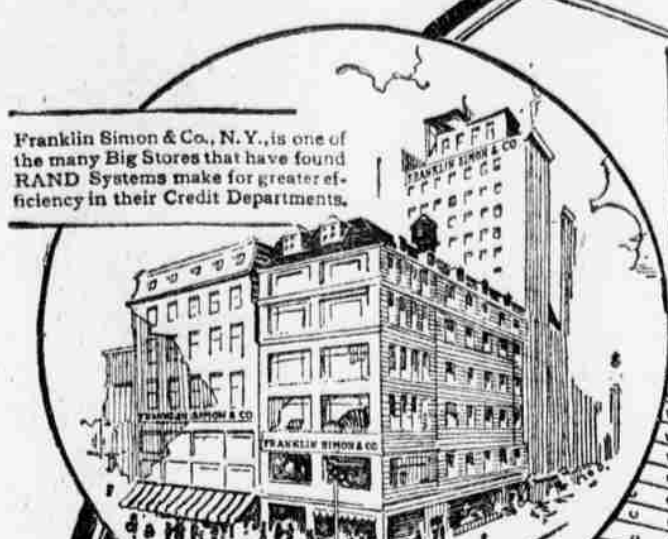
Franklin Simon & Co., N. Y., is one of the many Big Stores that have found RAND Systems make for greater efficiency in their Credit Departments.

No business too large or too small—Rand visible control shows the facts at a glance