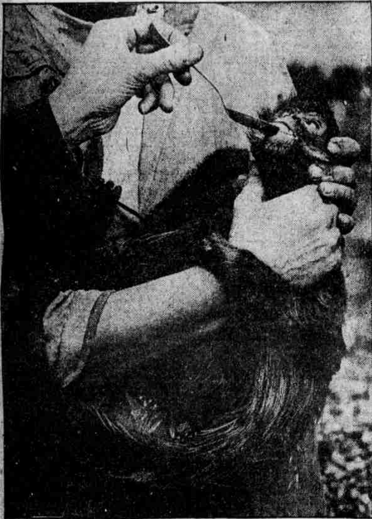
THE SPIDER MONKEY has taken something that didn't agree with him at the Simian Fraternity banquet. But he is determined to get well, so he takes his medicine like a little man.