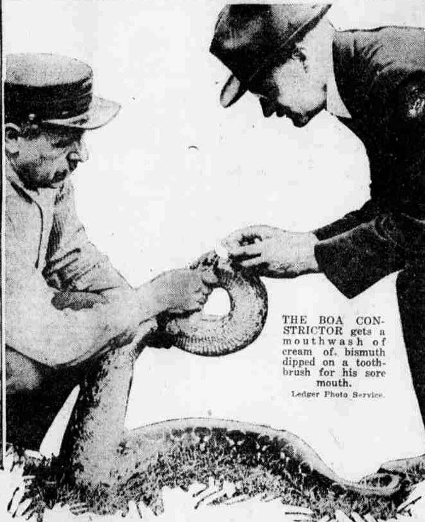
THE BOA CON- STRICTOR gets a mouthwash of cream of bismuth dipped on a tooth- brush for his sore mouth.