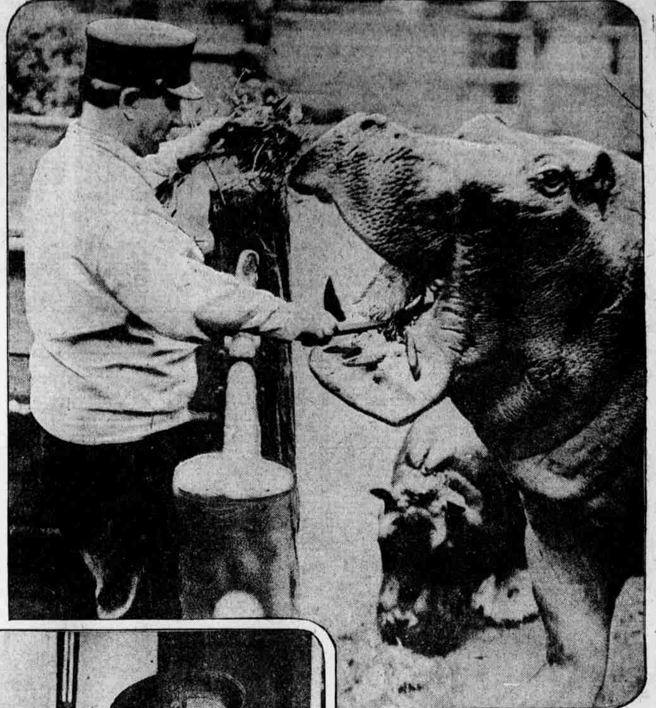
MISS FATIMA HIPPO has a little dental work attended to. She behaved splendidly while her molars were being filed. The patient did not insist on gas, nor did she show any signs of emotion.