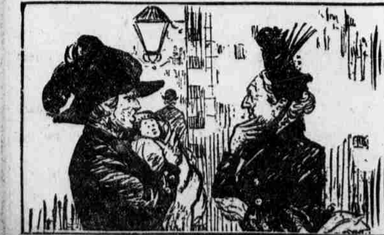
—The Passing Show. Mrs. Iggins— We christened 'im 'Aroid, from the 'ymn book. Mrs. Ogden— But, dearie, I've never seen 'Aroid in the 'ymn book. Mrs. Iggins— Oh, but surely you've 'eard 'Ark! the 'aroid kugels