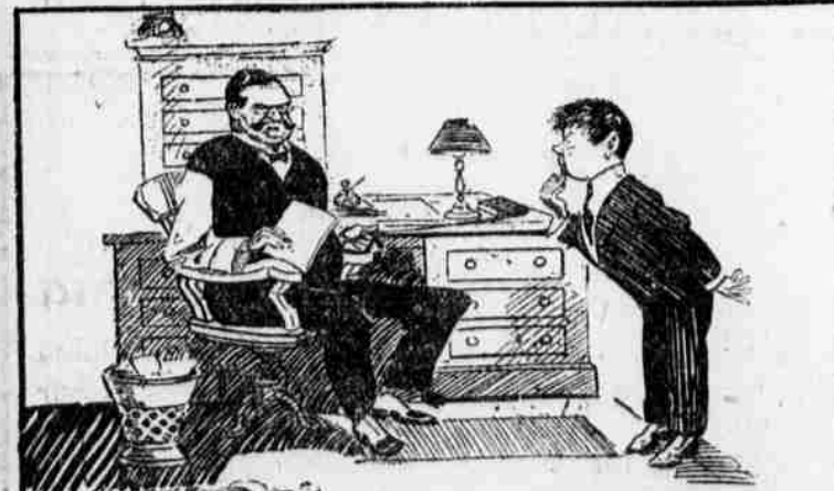
—London Opinion. "But didn't you go off once before to attend your grandmother's funeral?" "Yes, sir. She came near being buried alive that time."