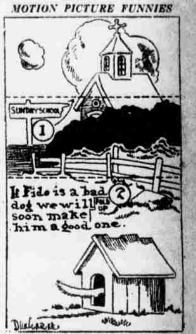
Cut out the picture on all four sides. Then carefully fold dotted line 1 its entire length. Then dotted line 2, and so on. Fold each section underneath, accurately. When complete turn over and you'll find a surprising result. Save the pictures.