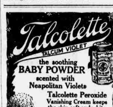
Exhibit and Demonstrations by