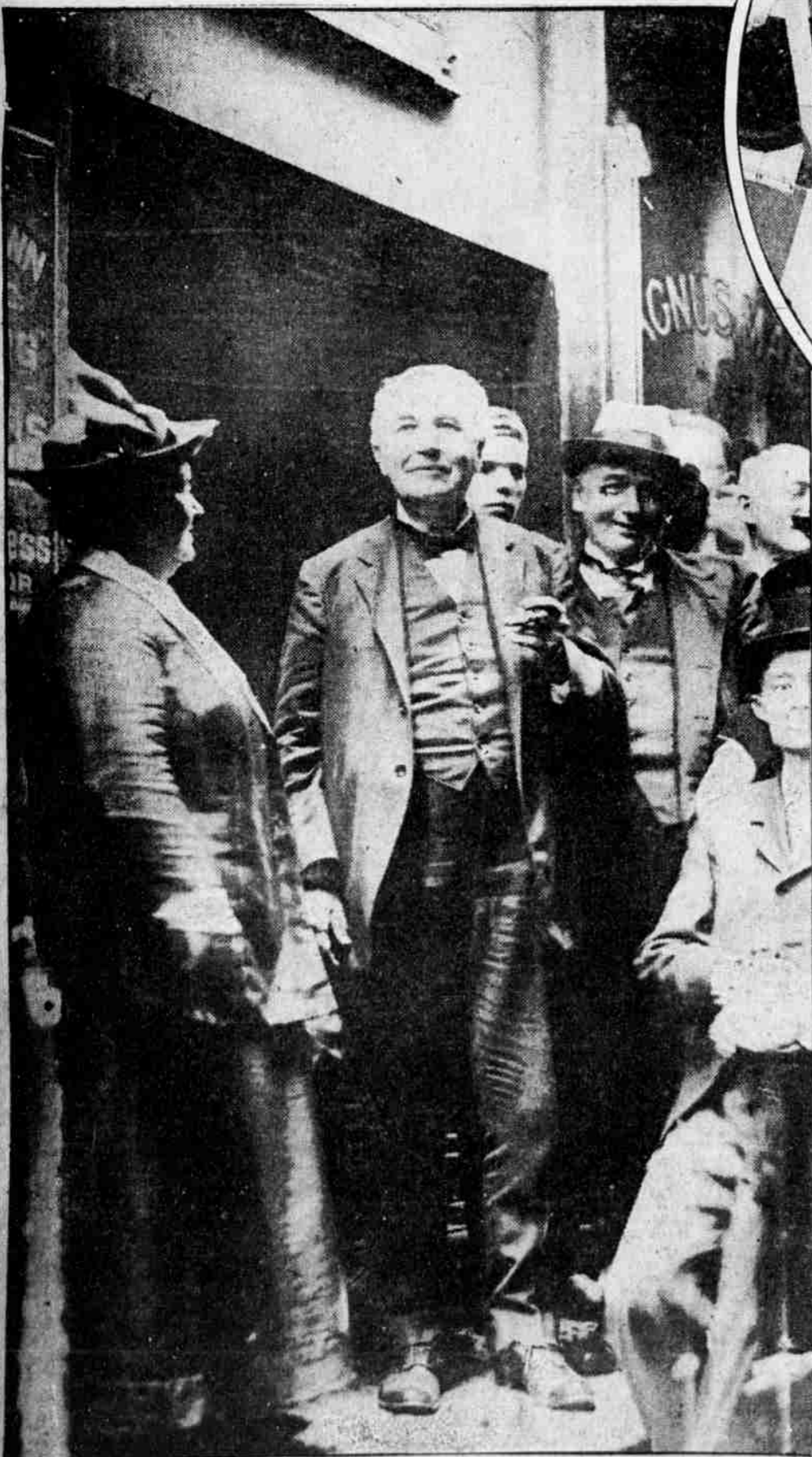
THOMAS A. EDISON , the inventor, underneath the tablet on the building at 257 Pearl street, New York city, site of the first central electrical lighting station. The plant was placed in operation in September, 1882.