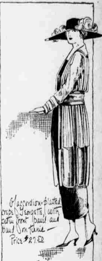
Class of dresses—plaited crepe de chine, tunic, with vestee, some with round neck-line, some with flat braid and buttons. Price $27.50

Surplice, panel, straight-line and tunic models, some with smart pockets, some trimmed with flat braid and buttons—very attractive, and so many styles. Navy blue and black.