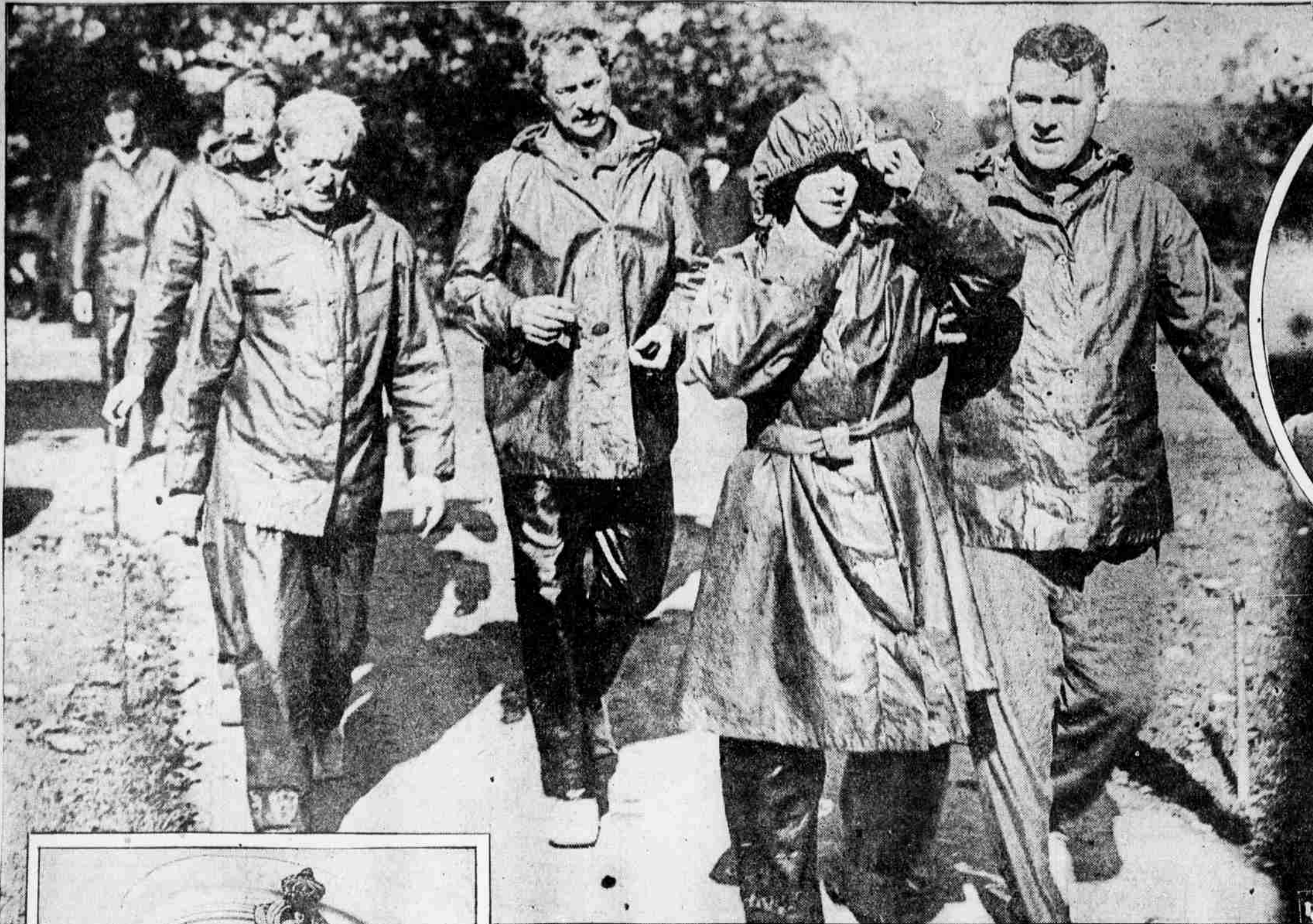
A MOST INFORMAL glimpse of the Belgian rulers, King Albert and Queen Elizabeth, wearing the raincoats and oilcloth suits so necessary when viewing Niagara Falls from the moist Cave of the Winds. The attendant who helped King Albert into his waterproof clothing said, "All right king, you're ready now," as he slipped the coat on the royal visitor.