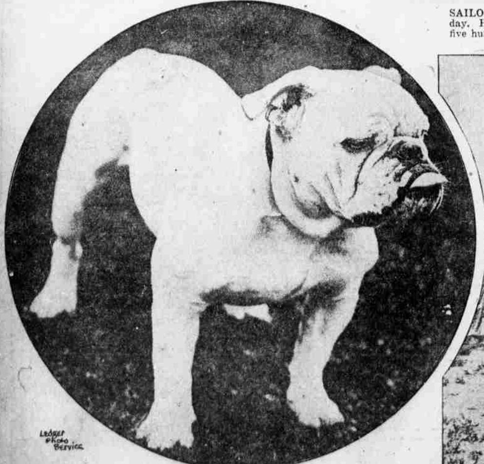
HE HASN'T the slightest intention of being disrespectful. Silent White Duke is entirely too well bred; his aristocratic tongue is merely a bit crowded indoors. On his recent visit to the Germantown Cricket Club he was the recipient of highest honors and attention.