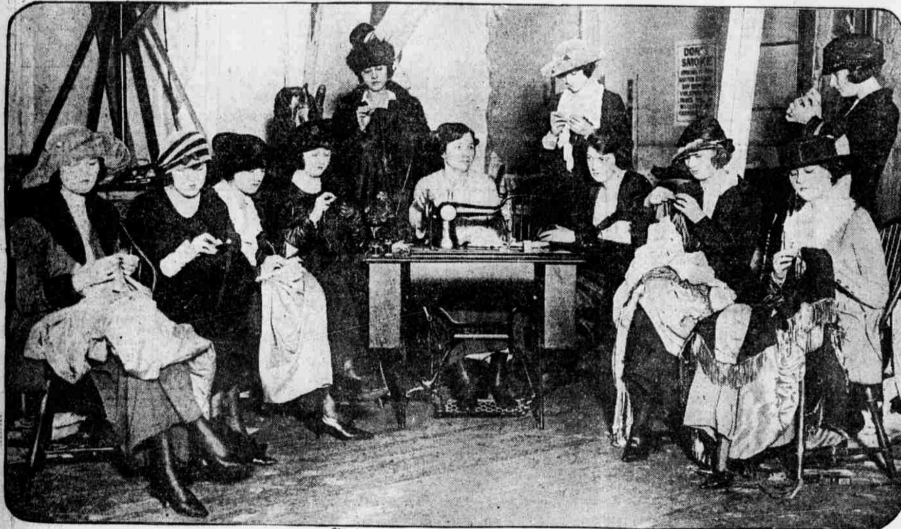
ARTISTS' MODELS of New York appearing in a Greenwich Village theatrical production have organized a community sewing circle for the purpose of making each other's fall wardrobes and repairing costumes, thus helping to reduce the high cost of their living. The circle sews one hour each day.