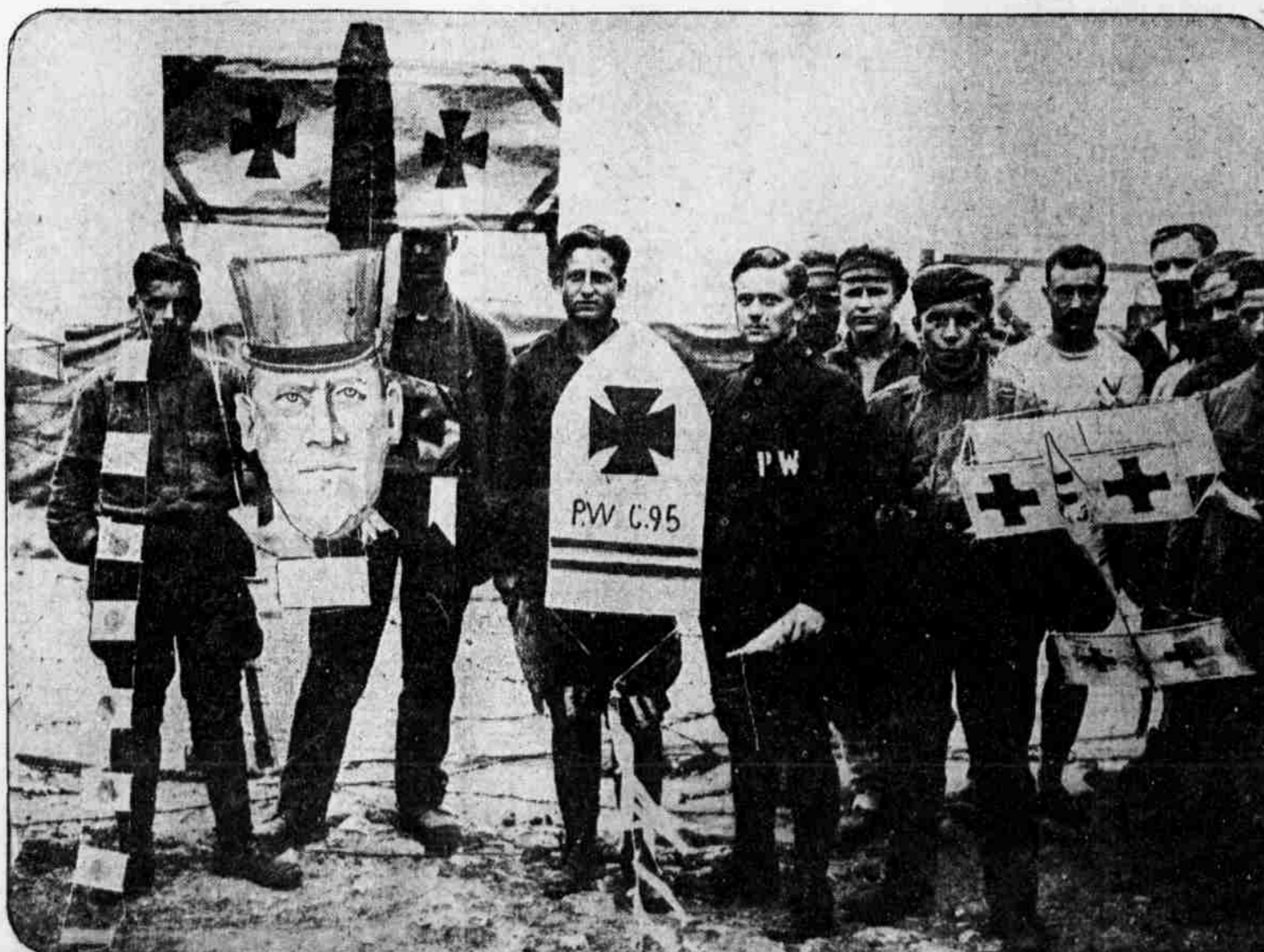
GERMAN PRISONERS in the American camp at Is-sur-Tille were skillful kite-fliers. One ingenious Teuton frequently flew "Wilson and his fourteen points" before the recent repatriation of the war prisoners.