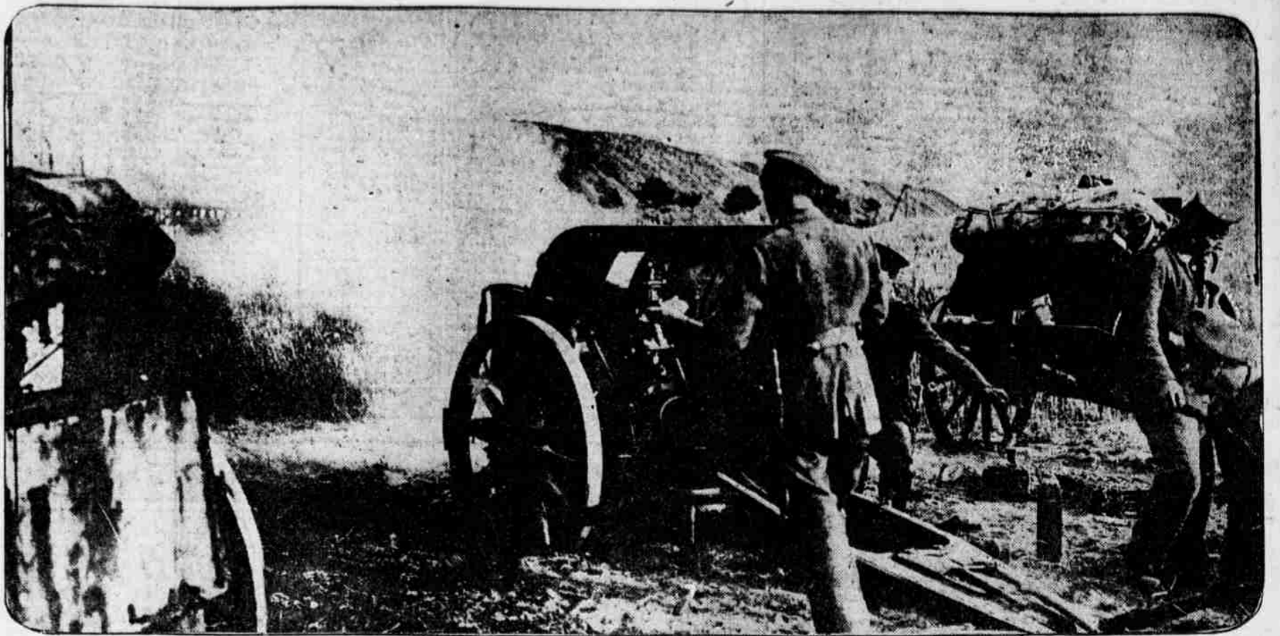
GERMAN ARTILLERY firing on Poles under cover of an embankment at the Niki Shaft, in Upper Silesia. Germany has been ordered to evacuate this territory by the Paris Peace Conference.