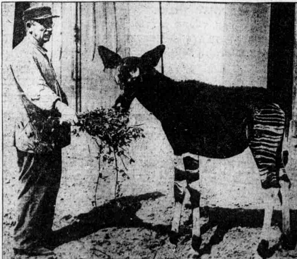
A SPECIMEN of the rare okapi secured from Congo natives by a Belgian administrator and now in the Antwerp Zoo. The species is closely allied to the giraffe.