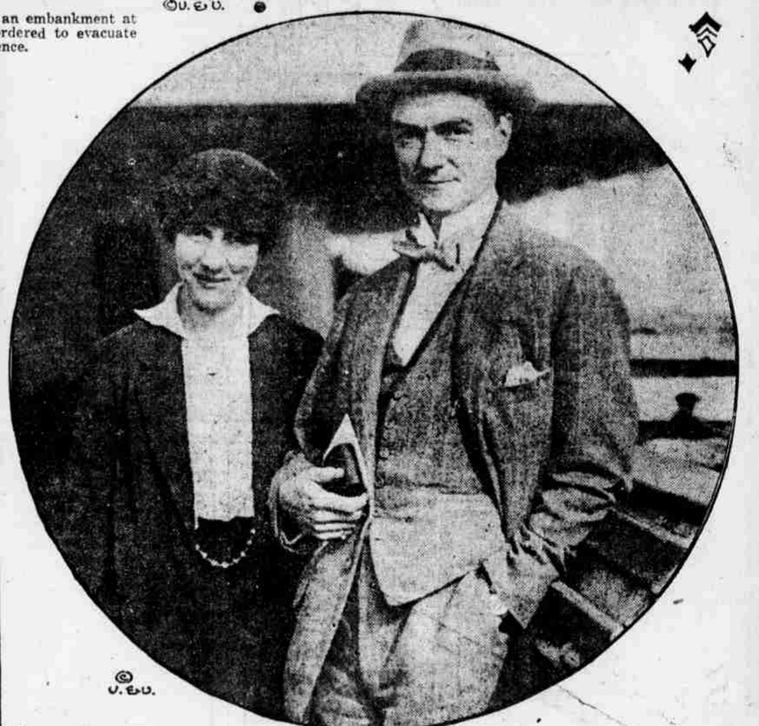
JOHN DRINKWATER and his wife, recent arrivals in America. Mr. Drinkwater was an English insurance clerk, who achieved fame and fortune as the dramatist of the London success, "Abraham Lincoln." He hopes to write plays about Washington, Mary Stuart, Cromwell and Robert E. Lee.