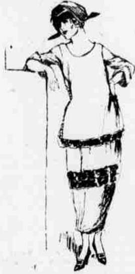
A great many of these gowns have fringe reaching almost from waist to hem. Prices are $140 to $300.

A redingote of duvetyne has a satin petticoat and metal-cloth vest.