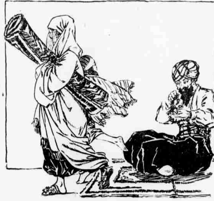
(Seventh Floor, Central)