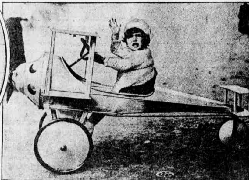
AIRPLANE TRICYCLE, popular in London at present. The tricycle was designed by an English army aviator for his little daughter. Of course it doesn't fly, but it gets over the ground in fast time.