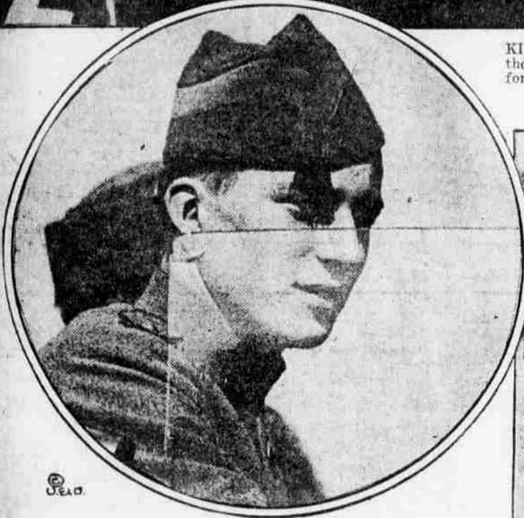
CROWN PRINCE LEOPOLD, Duke of Brabant, heir apparent to the throne of Belgium, who is accompanying his soldier father and queen mother on their visit to the United States.