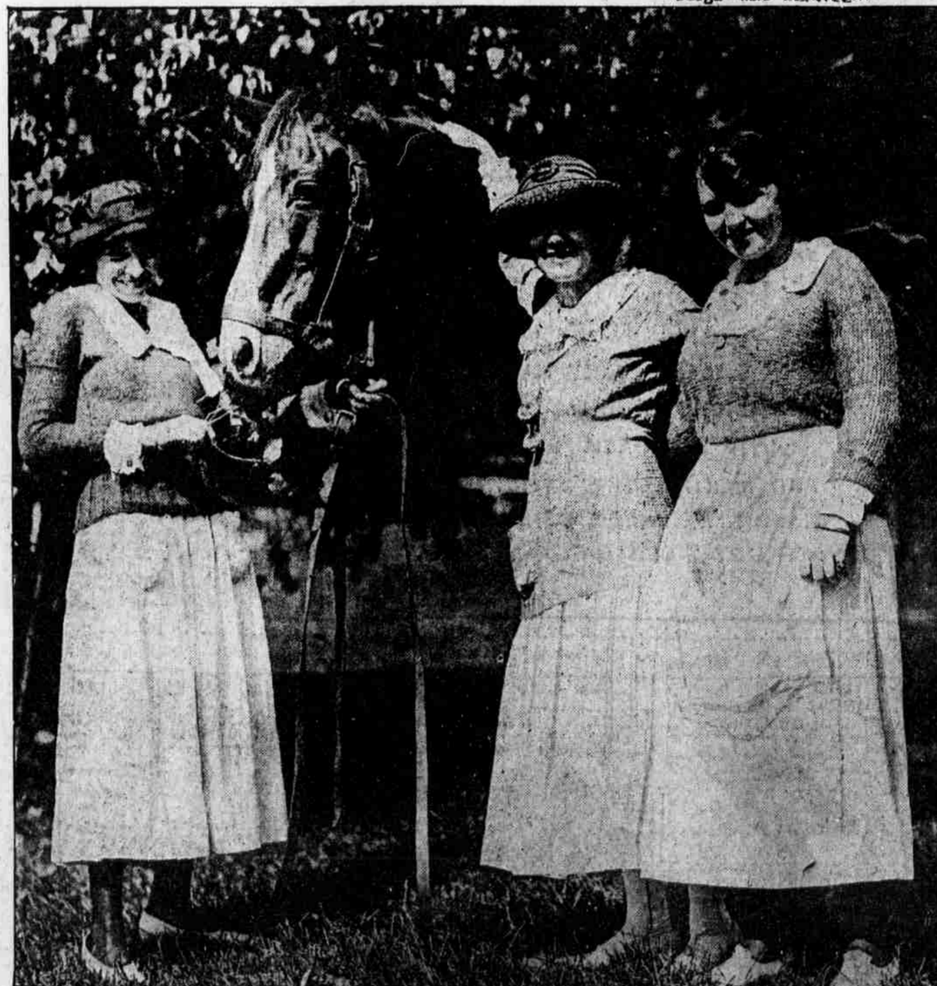
Ledger Photo Service...