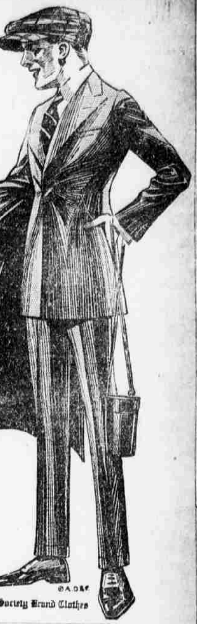
Society Brand Clothing

—Gimbels, Special Auditorium, Sixth floor.