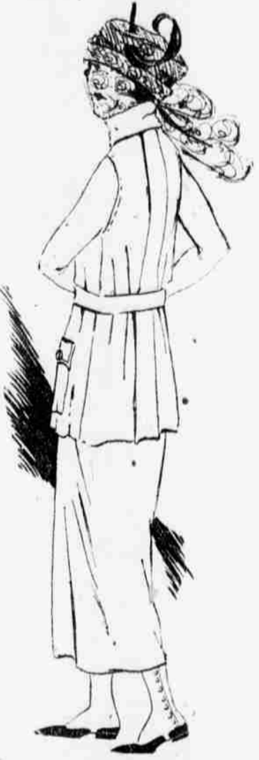
"Flex-o-Tex" Suit at $29.75