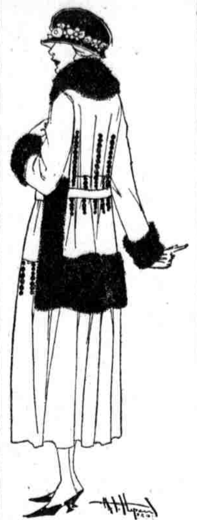
An attractive coat that could be worn in the afternoon or evening. It is in velour with seal trimming.

A Daily Fashion Talk by Florence Rose OUR ideas about coats have changed immensely within the last few years. Once our coat was simply the outside-brown paper wrapper in which we were enveloped.