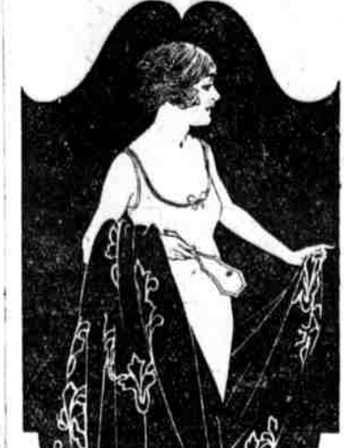
Weights and models for every season—high, low or business work with or without sleeves, knee or ankle length. Extra sizes for full or stout women. Purchasable and children, too.

have been coming in fast. More than forty employers have applied for dietitians, chemists, social service workers and industrial managers. And fully 150 women have sought work along almost every possible line.