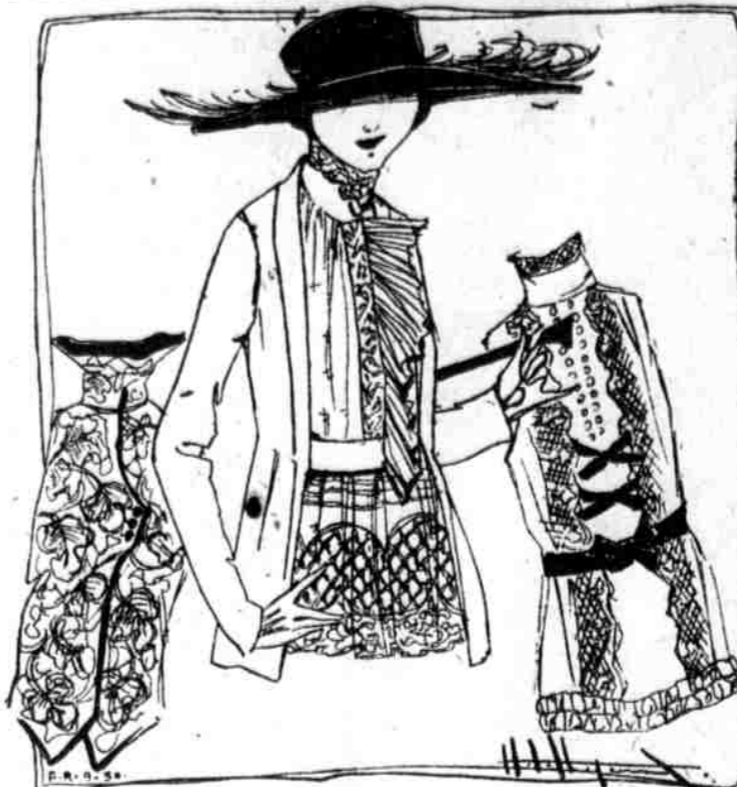
Here are waistcoats for the fall or winter suit. Prominent among them figures the one in metal brocade, at the left. All the vests are described in today's fashion talk

IF YOURS is a problem of making or tailoring a suit do for this winter, then the first thing to do is to buy some sort of waistcoat or gilet.