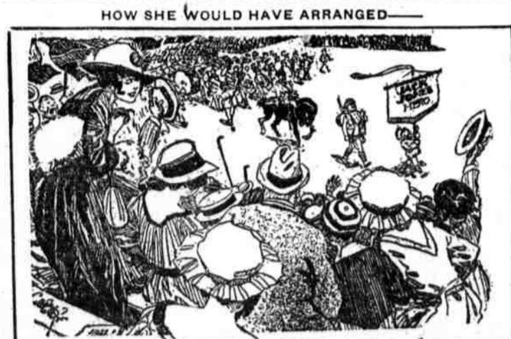
The victory parade.