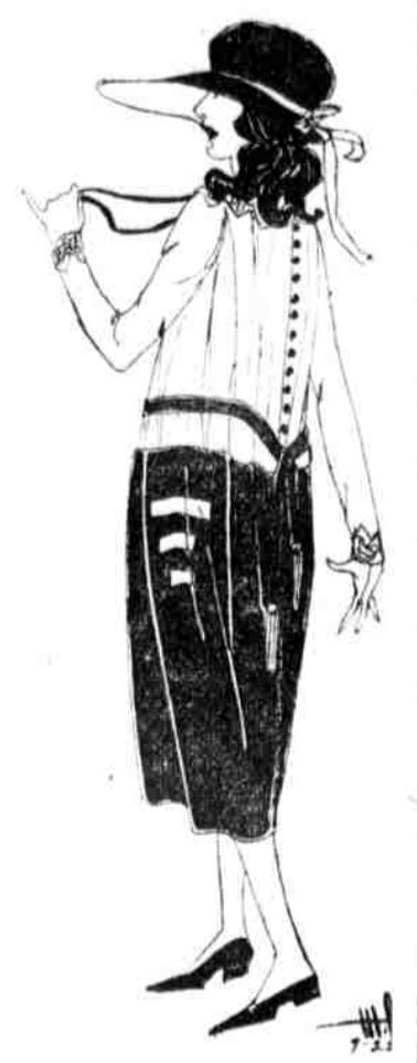
A dress that could be made from remnants or left-over pieces. The sash and buttons are a feature.