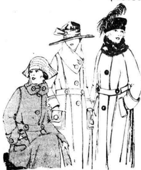
Three Coat Models at $25 each.