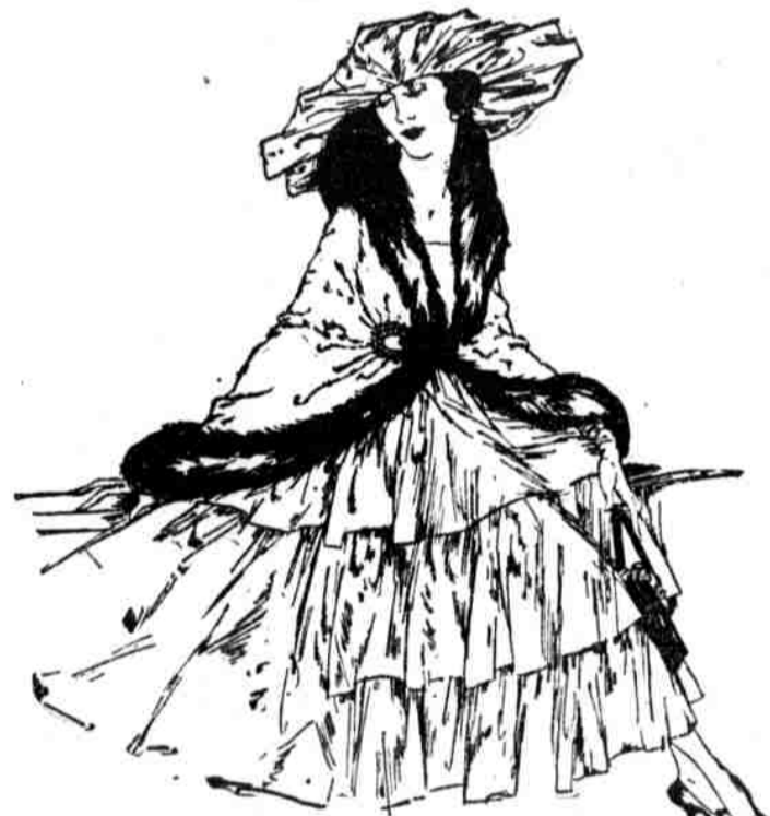
This is just one of the charming new fur wraps—all individual—shown in the New York Fashions Number of Vogue, out today. Be sure to look at them before you plan for your own fur.

Easily Assimilated and Digested Sold Everywhere